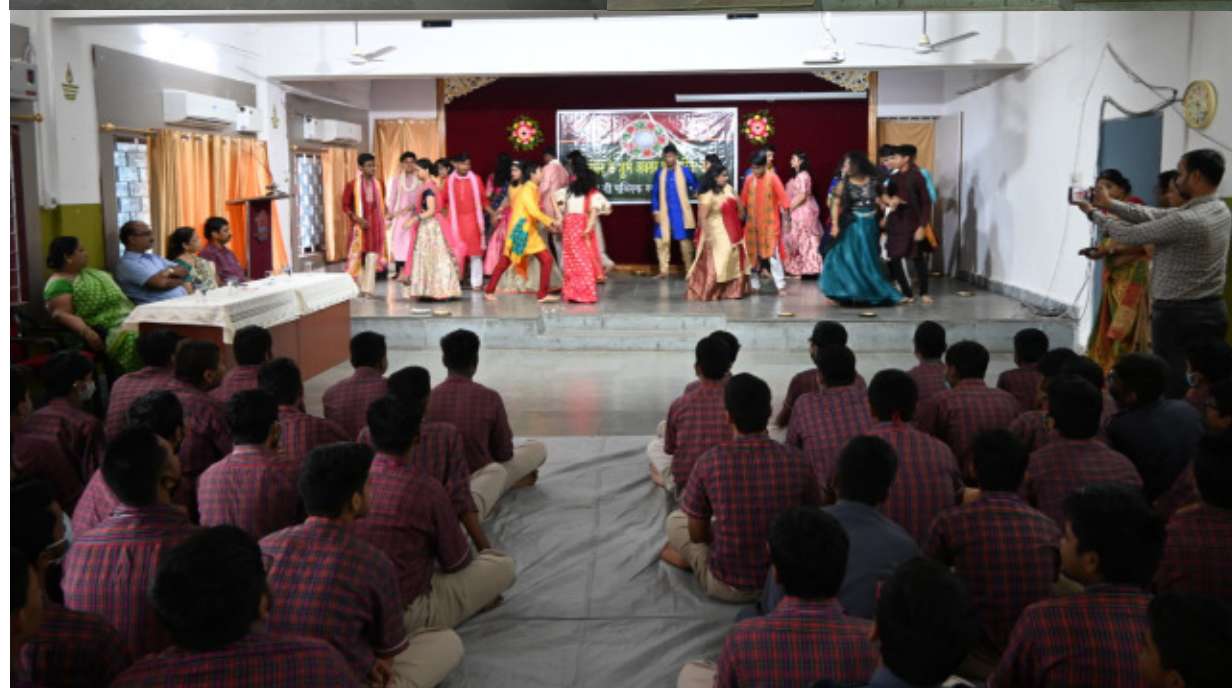
Raksha Bandhan celebrated at DAV Public School, Kalinga Nagar