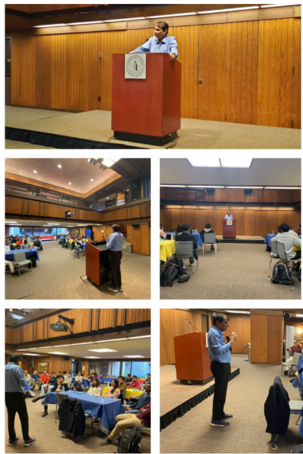
Shri Suresh Prabhakar Prabhu MP (and former Union Minister for multiple Ministries) is leading an Indian delegation from Rishihood University, in his capacity as the founder-Chancellor, to

"As a cash crop it can be good locally but also in the global market," he told AFP. "It can be a leader in the world."