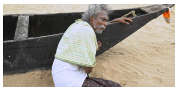
Mahanadi" produced under the banner of Sani Films on 23 April