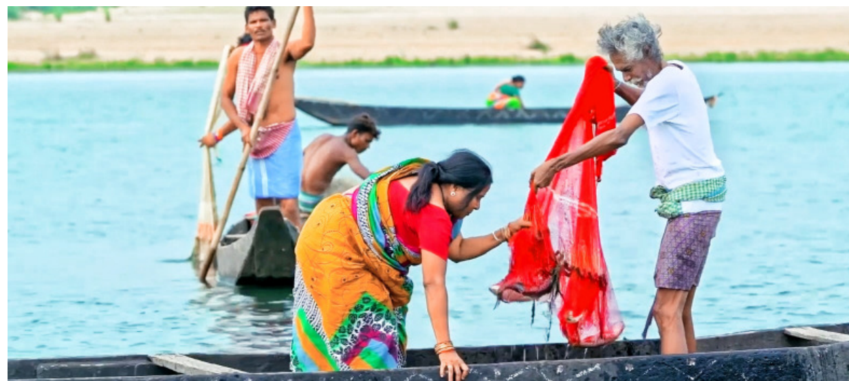
The short film "Sani - The Son of River" was awarded Best Film in the 'Livelihood and Sustainable Technologies' category at the 11th CMC Vatavaran Film Festival and Awards.