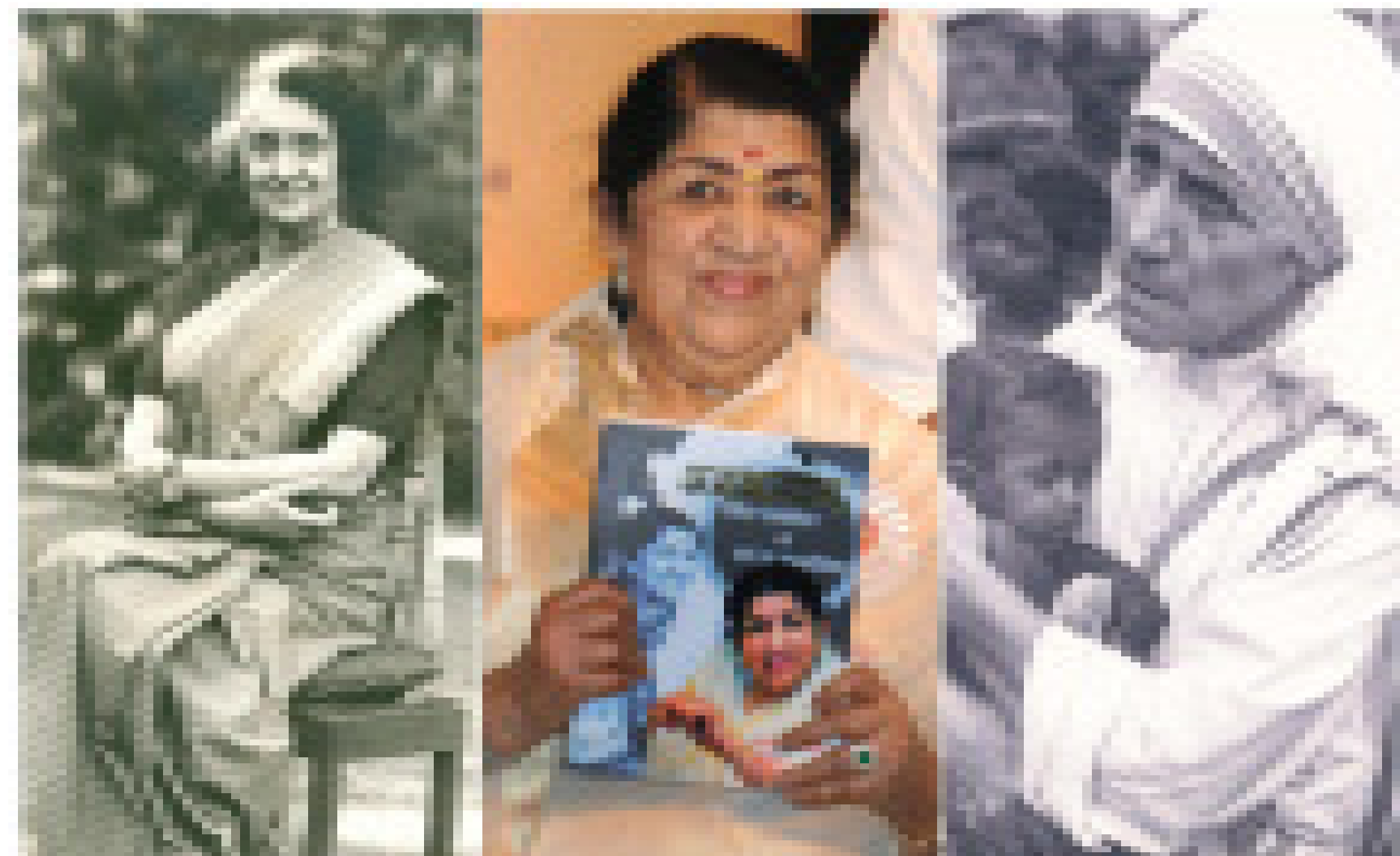
The Bharat Ratna is India's highest civilian award and recognises 'exceptional service/performance of the highest order'.