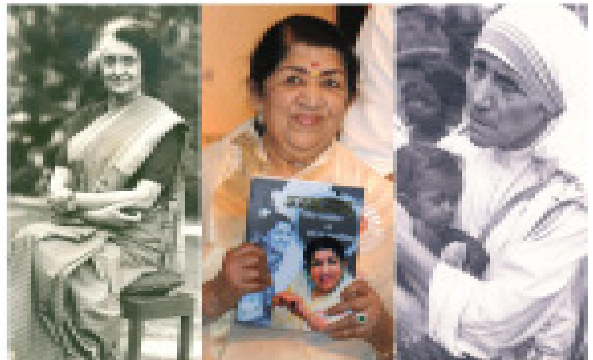
The Bharat Ratna is India's highest civilian award and recognises 'exceptional service/performance of the highest order'.