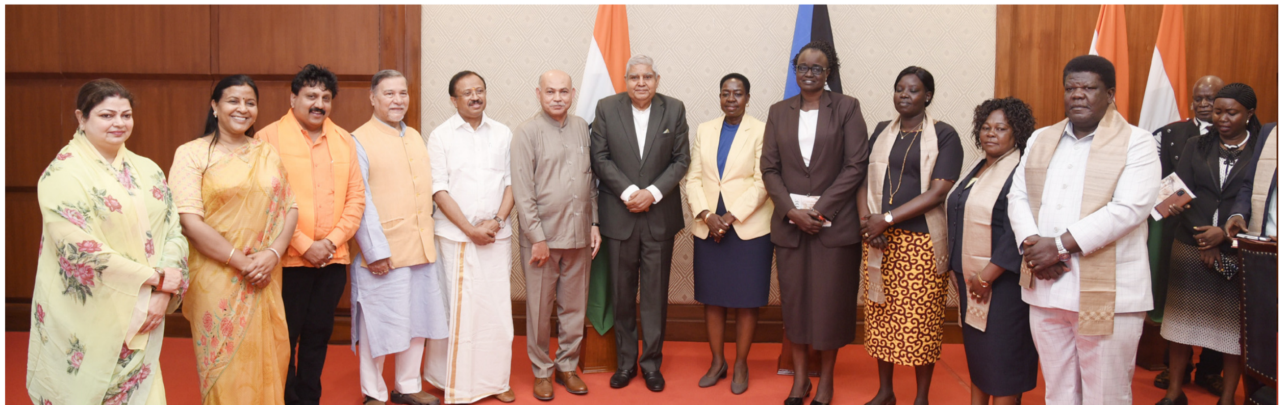
The Vice President & Chairman Rajya Sabha, Shri Jagdeep Dhankhar receiving a Parliamentary Delegation from South Sudan, led by Ms. Jemma Nunu Kumba, the Speaker of the Transitional National Assembly, at Parliament House, in New Delhi

Gujarat elections in 2022 and submitted the details of the votes it had secured there to the Commission and sought recognition as a national party as per Clause 6B of the Act. The AAP pointed to the condition that a party which obtains six per cent of the votes in four different states would be eligible for recognition as a national party.