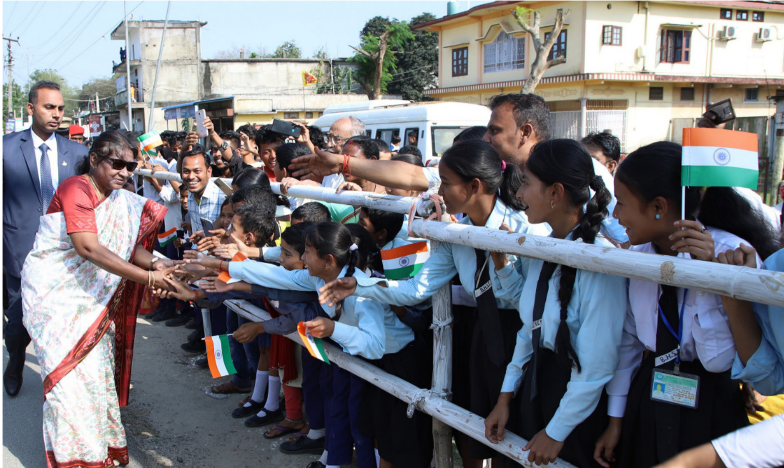
The President of India, Smt. Droupadi Murmu receives warm welcome by students and local people on her arrival at Golaghat, in Assam