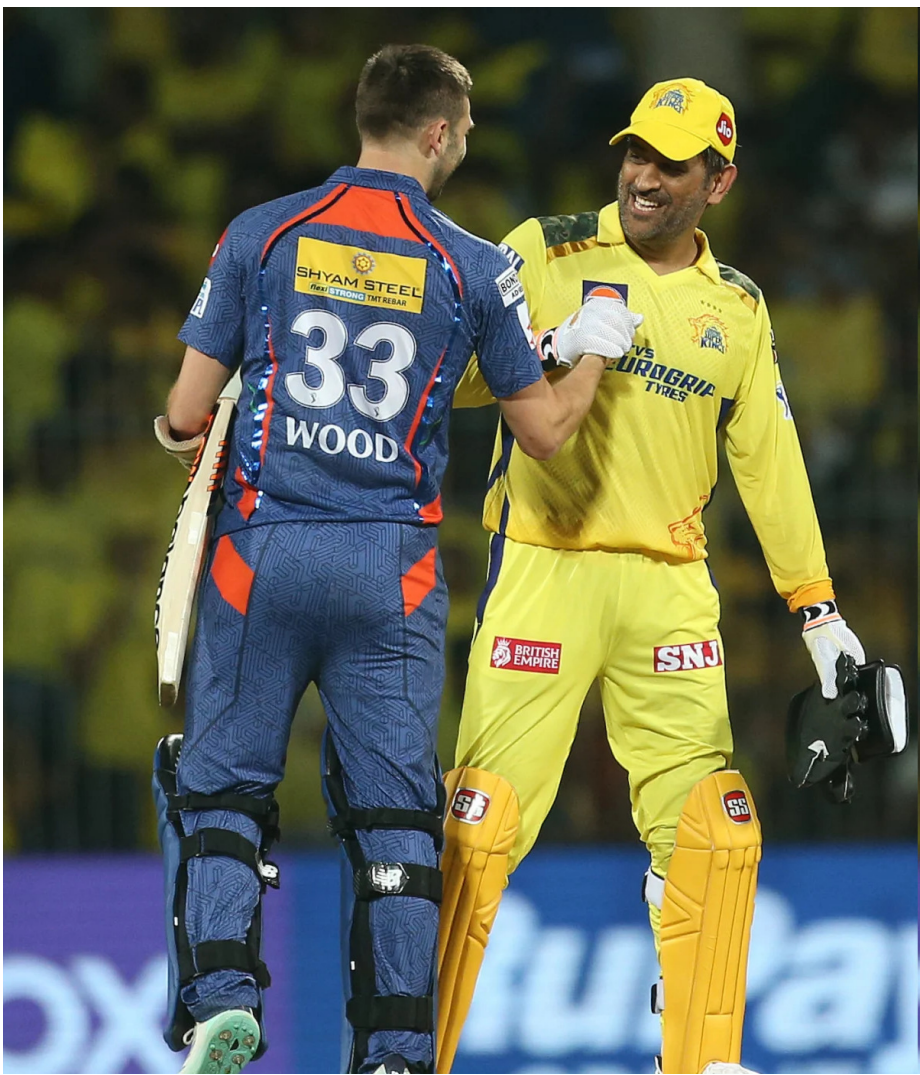
MS Dhoni has a laugh with Mark Wood after the game