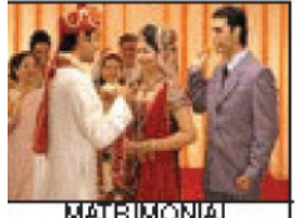
MATRIMONIAL BRIDE WANTED

Saving 10,000/- for high return, extra earn and foreign trip opportunity, 8238904001. Independent business work from home, training in Singapore, 8338014287.