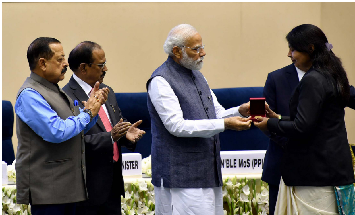
PM conferring the President's Police Medal for Distinguished Service and Gold Medal for Best Investigating Officers of CBI at Vigyan Bhawan, in New Delhi