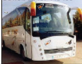
TOURS &amp; TRAVELS

Required Single / Double / Triple Storied North/East facing building at Puri. Contact 9437143483