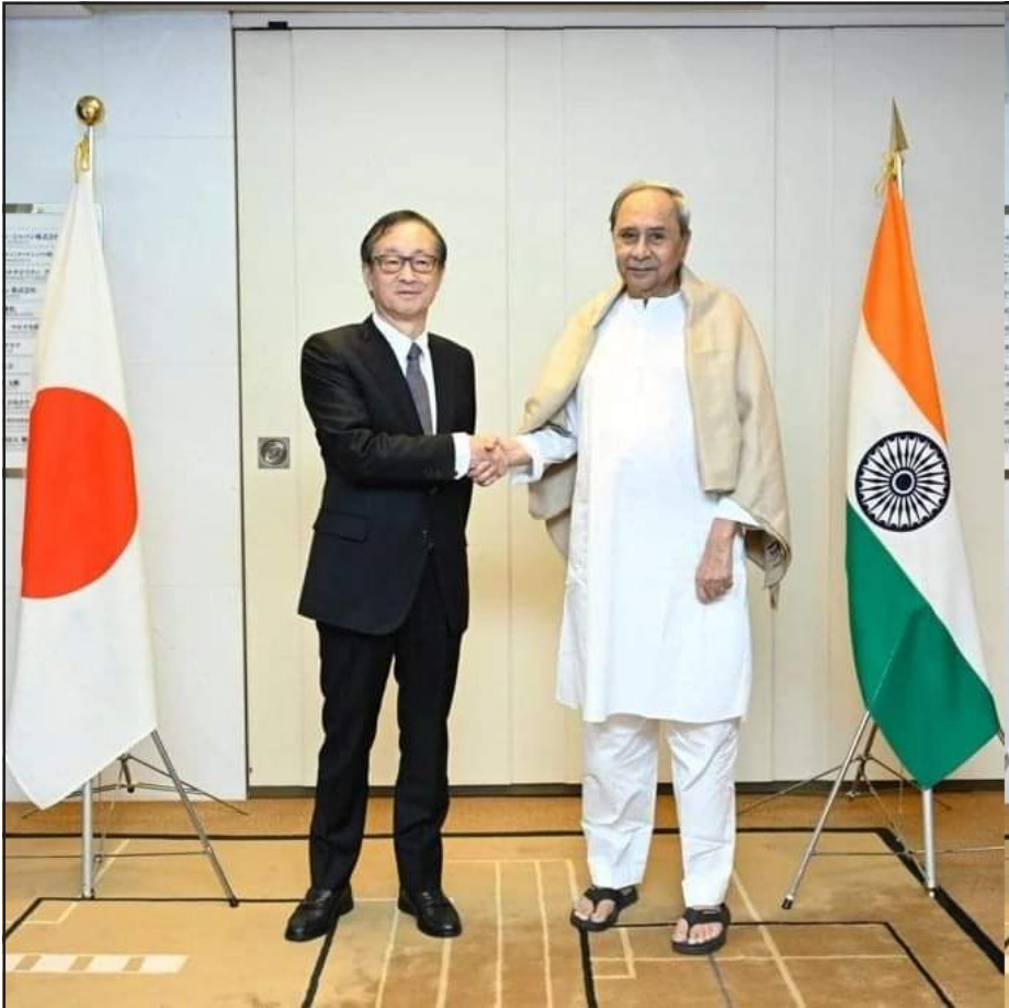
Nippon Steel Corporation President Mr Eiji Hashimoto meeting Hon'ble Chief Minister Shri. Naveen Patnaik in Tokyo.