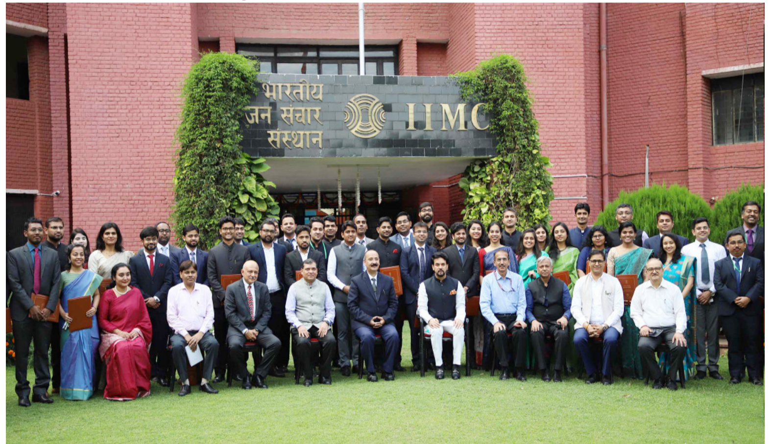
The Union Minister for Information & Broadcasting, Youth Affairs and Sports, Shri Anurag Singh Thakur with the Officers on the occasion of the valedictory ceremony for Indian Information Service Officers of 2018, 2019 and 2020 batches at IIMC, in New Delhi

Mr Bhagwat said apparently referring to the surgical strikes on terror camps in that country, adding "we do it and we will keep doing it". "People of Pakistan are now saying the division of Bharat was a mistake. All are saying it was a mistake," Mr Bhagwat asserted. Hailing the Sindhi community, most of who arrived here during Partition, Mr Bhagwat said they had come "from that Bharat to this Bharat for the sake of your rich Sindhu culture and values".