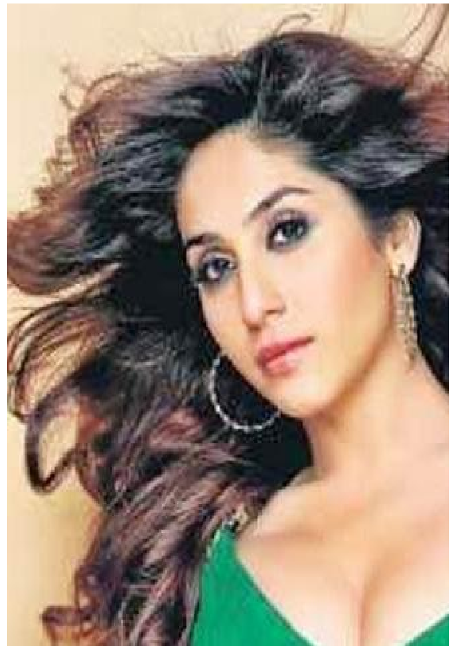
From being a 'Viva!' girl to winning the Best Playback Singer (Female) award for her song 'Jag Ghoomeya' from Salman Khan starrer Sultan, Neha Bhasin bares all about her journey in an exclusive chat.

make her stage debut in an award gala. A source says, "The award season is on and the award shows fall over each other to make sure that they come up with some talking point or the other. So, the organisers of this particular award show event, have managed likely to perform with Himesh Reshammiya. Iulia and Reshammiya have already recorded one song together for his upcoming album. Salman too is likely to be present at this event, and it would be interesting to see his reaction." Prior to this Iulia from Sultan. Ever since Iulia has returned in the country to record her song, she has constantly been spotted at various parties with Salman. The duo, however most of the time makes sure that they enter and exit the venues in different cars.