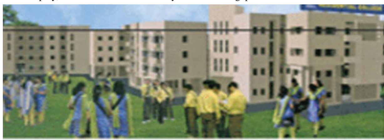
COURSES AT KBRC

oppose the restructuring that makes Indian Super League (ISL) a top-tier league and relegates I League to the second division or 'League One' as it will be called.