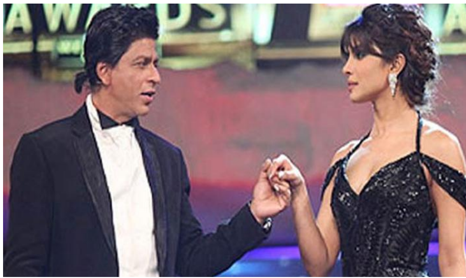
Priyanka Chopra and Shah Rukh Khan last appeared together in Don 2, which released in 2011.