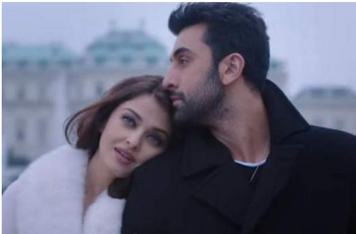
ADHM and Shivaay still in the competition