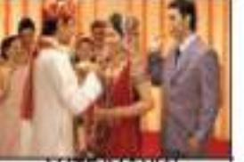
MATRIMONIAL BRIDE WANTED

Saving 10,000/- for high estem, extra eam and -oreign trip opportunity. 238904001. Independent business work from home, training in Singapore, 2338014287.