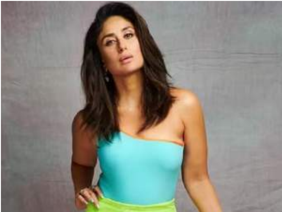
figure in the film industry. His meteoric rise, coupled with endorsements from industry peers like Kareena Kapoor Khan, reinforces his status as a true global icon. Yash has etched his name as a formidable talent with global appeal. He is not just a superstar; he is an icon who has united audiences from diverse backgrounds and cultures, proving that talent and authenticity are universal languages that transcend boundaries and create lasting legacies.

Kapoor Khan was asked, "Which south actor would you like to be paired up with? Prabhas, Ram Charan, Vijay Deverakonda, Allu Arjun and Yash" she expressed her desire to collaborate with the southern sensation and she promptly responded with "Yash," proudly declaring herself a 'KGF girl.' Yash's presence on the international stage has transcended geographical boundaries, making him a sought-after