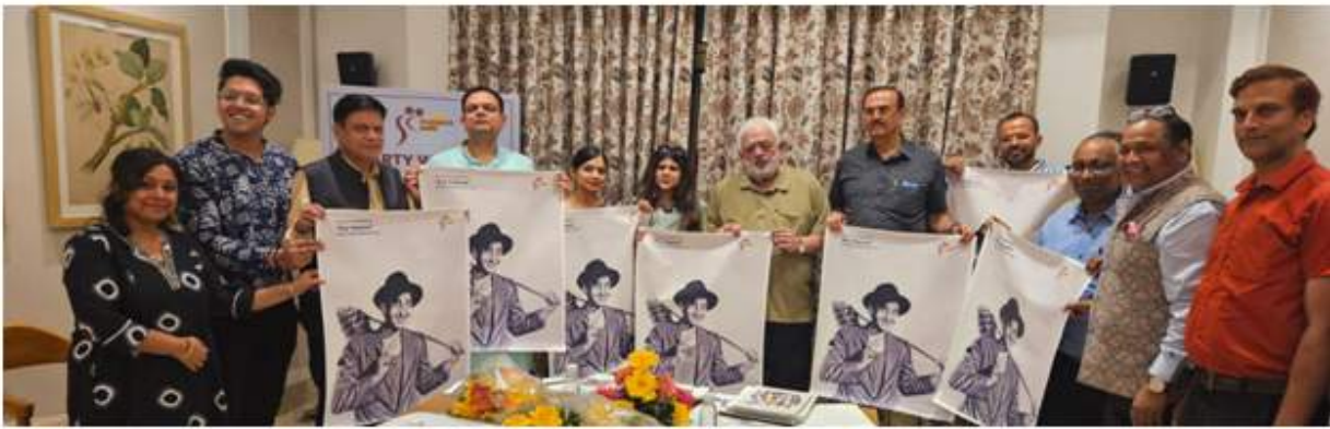
Architects of Birth Centenary programme of Raj Kapoor