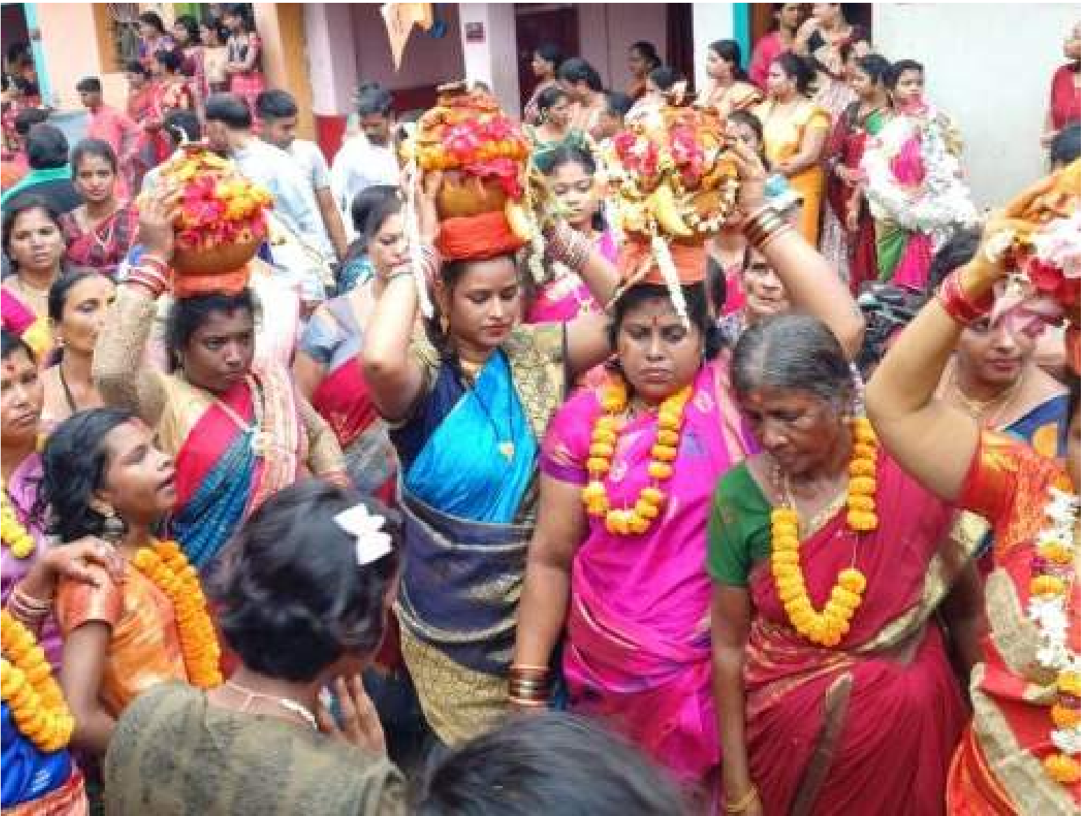
Women march in procession ahead of immersion ceremony of goddess Solapua Maa in Cuttack

Khurda, Nayagarh, Ganjam and Gajapati districts. Besides, thunderstorms with lightning may occur at isolated places in Nuapada, Kandhamal, Kalahandi and Rayagada, the bulletin said. In the past 24 hours till 8.30am, Odisha recorded an average rainfall of 19.7 mm, with the highest downpour of 105 mm at Binjharpur in Jajpur district, followed by 98.3 mm at Gopalpur in Ganjam and 94.9 mm at Nuagaon in Nayagarh.