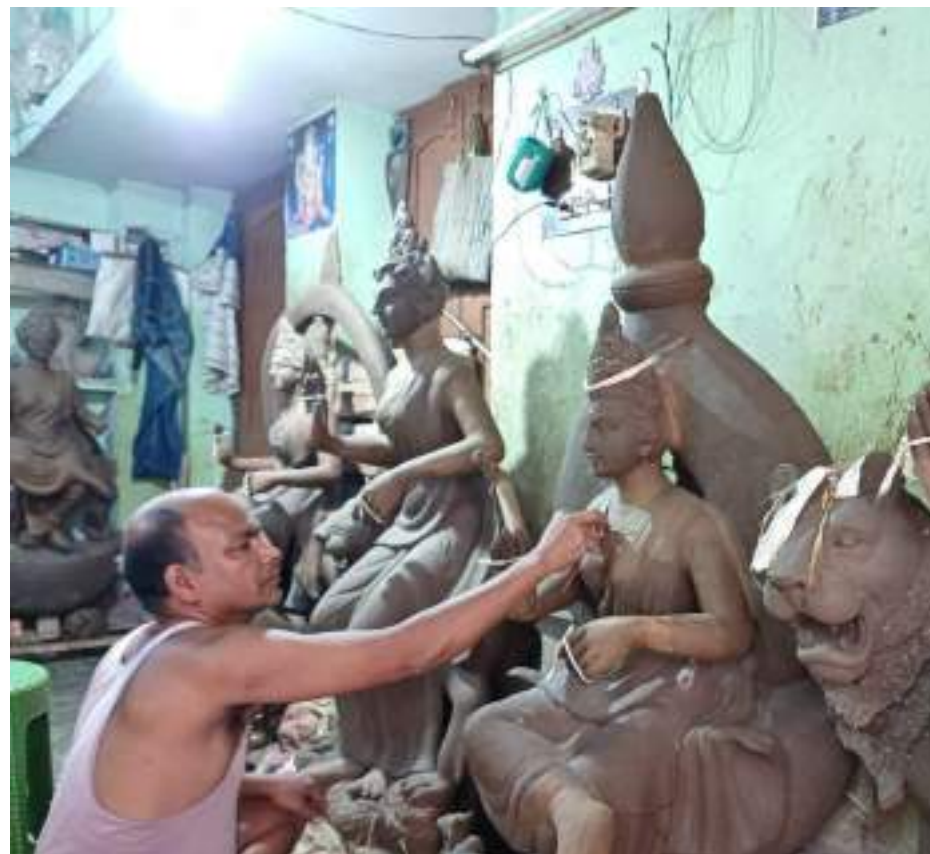
A man works on clay idols of goddess Khudurukuni in Kumbhar Sahi area of Cuttack