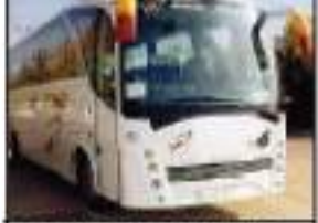
TOURS & TRAVELS

ACCOMMODATION WANTED Required Single / Double / Triple Storied North/East facing building at Puri. Contact 9437143482