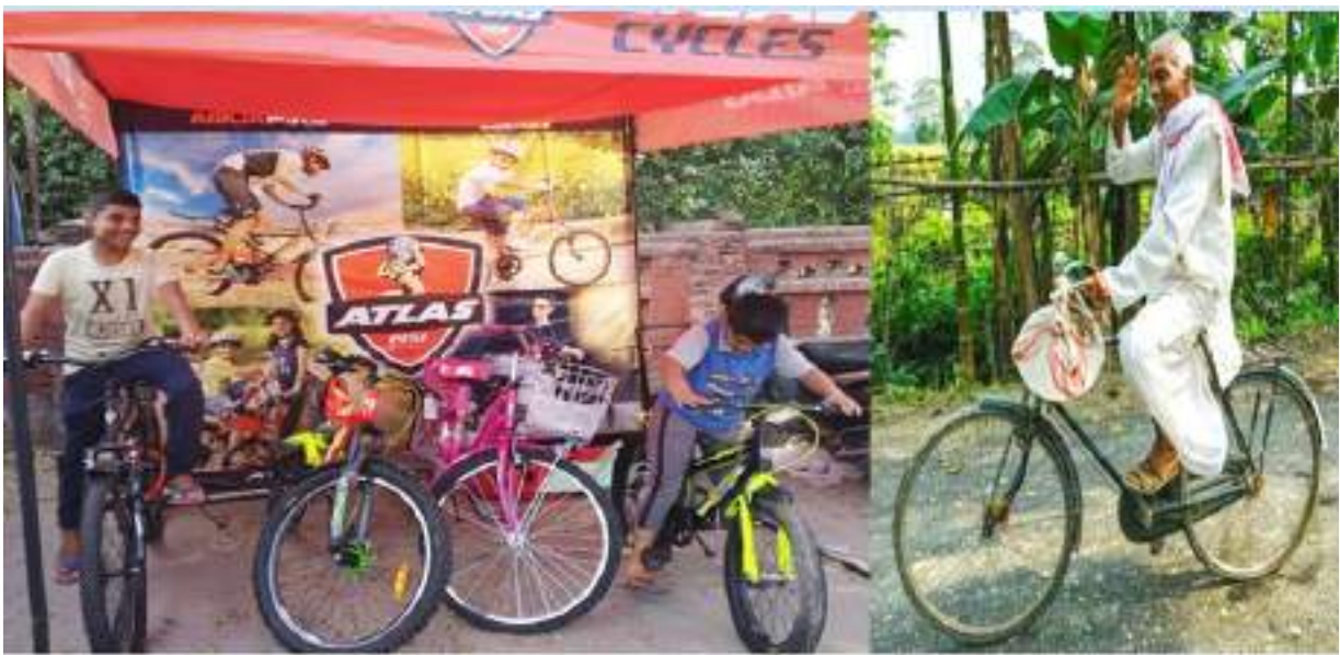
Atlas cycles-first revolution in post-independent India

It marked the start of the mass production of bicycles. From the introduction of rubber tires, chain-driven mechanisms, and lightweight materials to the innovations in braking systems and gear mechanisms, the history of bicycles is a testament to human ingenuity and the pursuit of efficient and sustainable transportation. Since then, bicycles have undergone numerous modifications and improvements, leading to the various types and designs seen in the market now. This mode