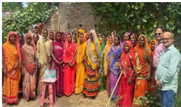
Gender equality at grassroots level