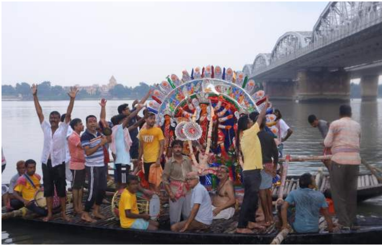
Preparations for the immersions of the Durga idol .