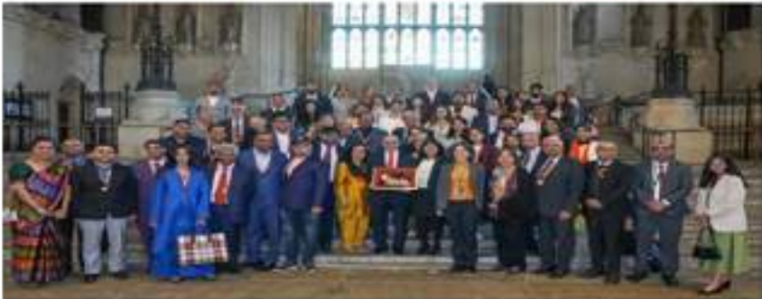
Virendra Sharma with guests and organizers at reception