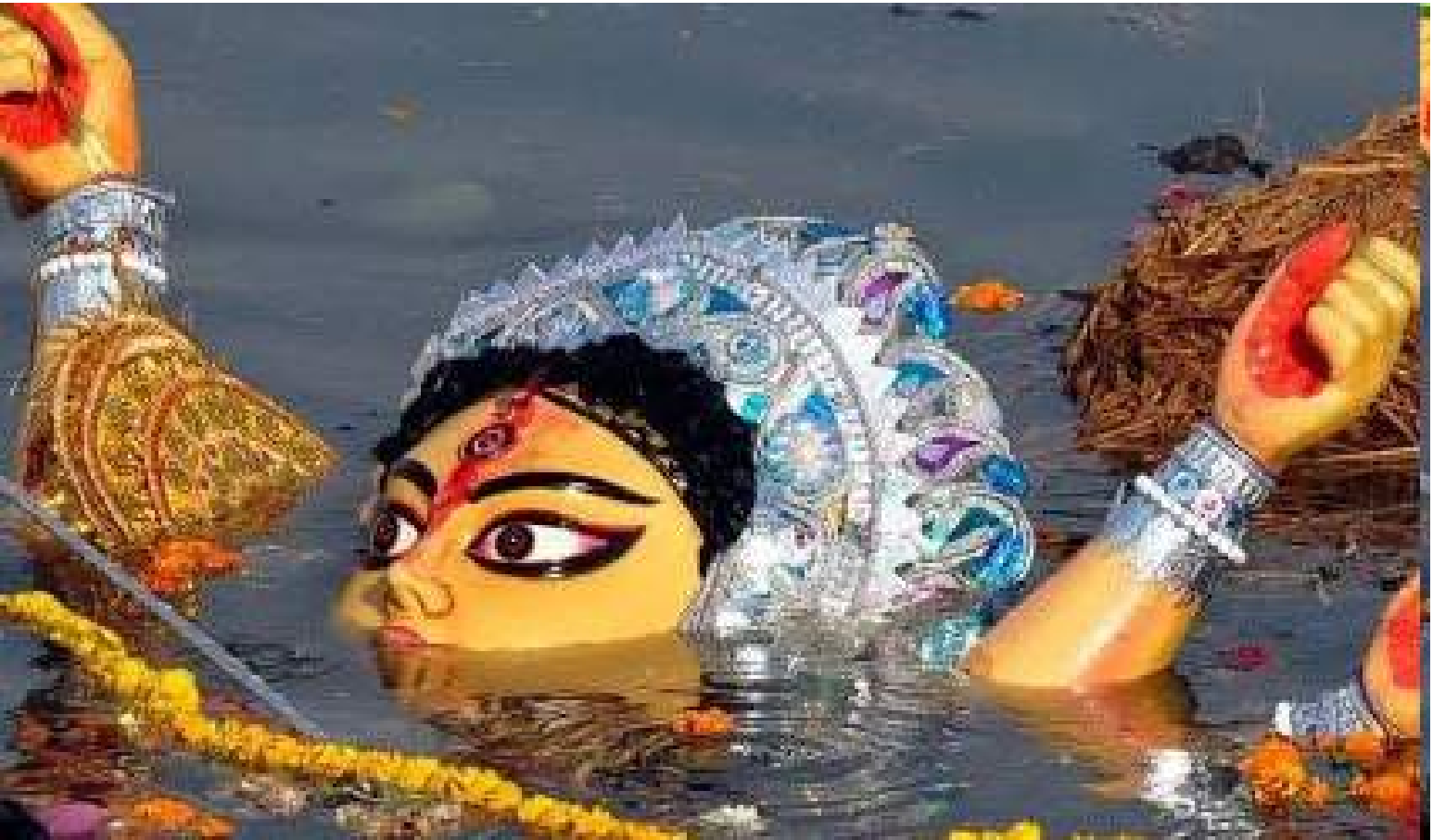
Odisha to bid emotional farewell to Goddess Durga

maintain the mantra "No Liquor and No DJ" during the immersion. This decision encouraged organizers to embrace traditional music and dance, enhancing the festive atmosphere. In Cuttack, over 20 idols are set to be immersed at Devigada, with lorries transporting the idols from various puja pandals to the Kathajodi River, accompanied by lively music and dance. To address the low water levels, three temporary ponds have been created along the riverbank, with pump sets on standby if needed. Meanwhile, the Bhubaneswar Municipal Corporation has set up five large temporary ponds to facilitate a smooth immersion process—two near the Kuakhai River, two near the Daya River, and one close to the Sai Temple in Hanspal. Additionally, stringent security measures have been implemented by the Bhubaneswar-Cuttack Commissionerate Police, along with a traffic advisory to manage congestion.