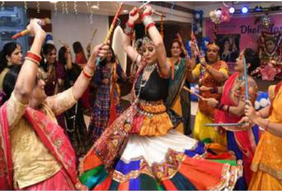
Jewellery adorned women & men folk performing Garba dance