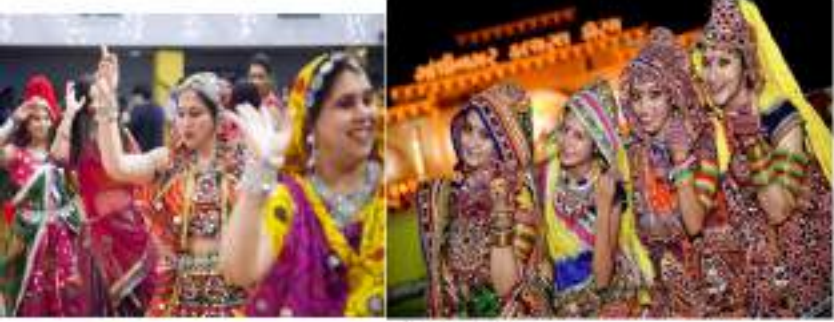
Sequences of Garba dance