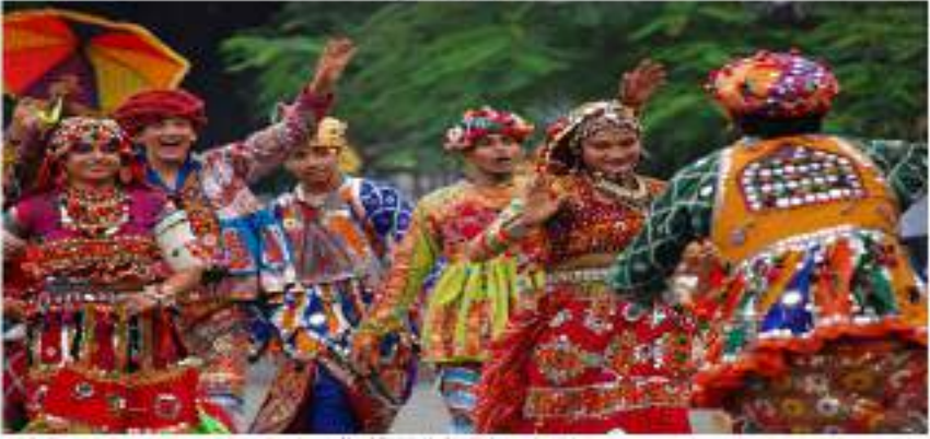
Men folk in the traditional dress in Garba