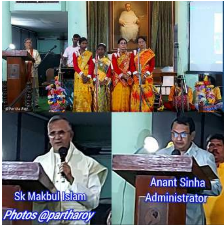
Kolkata(PARTHA ROY): The Asiatic Society presented Folk Music of Jungle Mahal and Chau Dance at its heritage premise Vidyasagar Hall in Kolkata on 22nd November 2024 during World Heritage Week celebration around