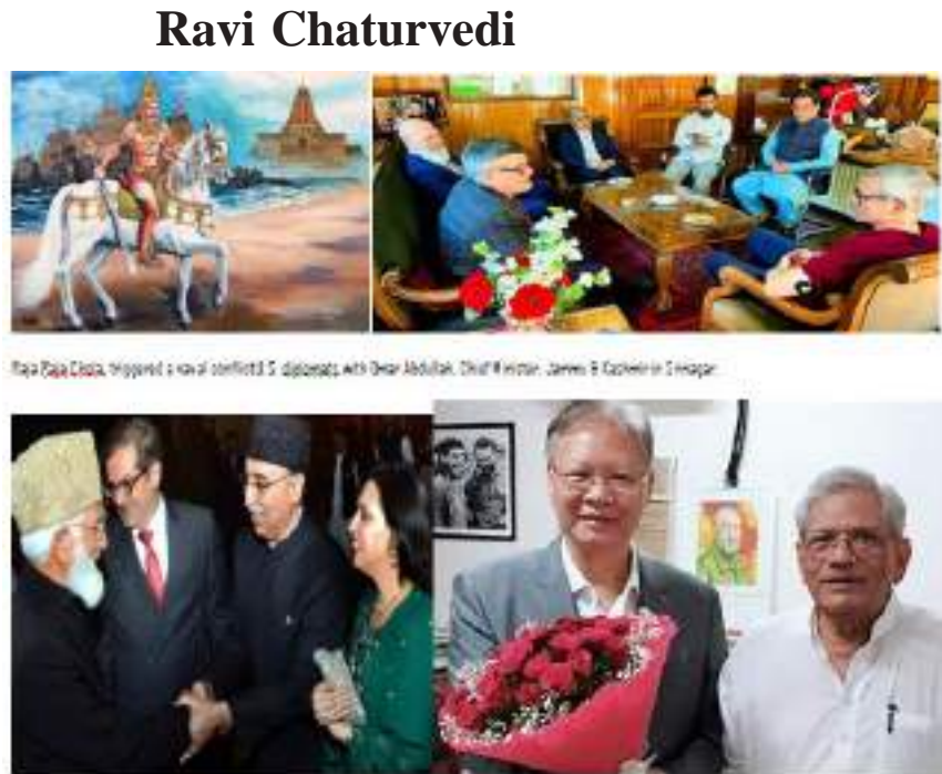
Raja Raja Chola, triggered a naval conflict with the Kulasekhara dynasty (Second Cheras), located in what is now modern-day India, sparked the naval conflict known as the Kandalur War in AD 994.

diplomacy across centuries. The arrest and mistreatment of an envoy from Raja Raja Chola by the ruler of the Kulasekhara dynasty (Second Cheras), located in what is now modern-day India, sparked the naval conflict known as the Kandalur War in AD 994. While diplomatic immunity grants foreign diplomats broad protections from local laws, it has unfortunately sometimes been abused, with documented instances of diplomats engaging in activities such as espionage, smuggling, violations of child custody laws, money laundering, tax evasion, making terrorist threats, human trafficking, child exploitation, and even murder. Such abuses, while shielded by diplomatic immunity, often breach the established codes of conduct that are meant to uphold the integrity of diplomatic roles. Notably, Indian diplomats stationed in countries like Pakistan, Iran, China, and Canada have experienced significant challenges. Despite the protections typically afforded to diplomats, they often encounter harassment, strict surveillance, and restrictions that confine them to embassy premises—conditions which contrast sharply