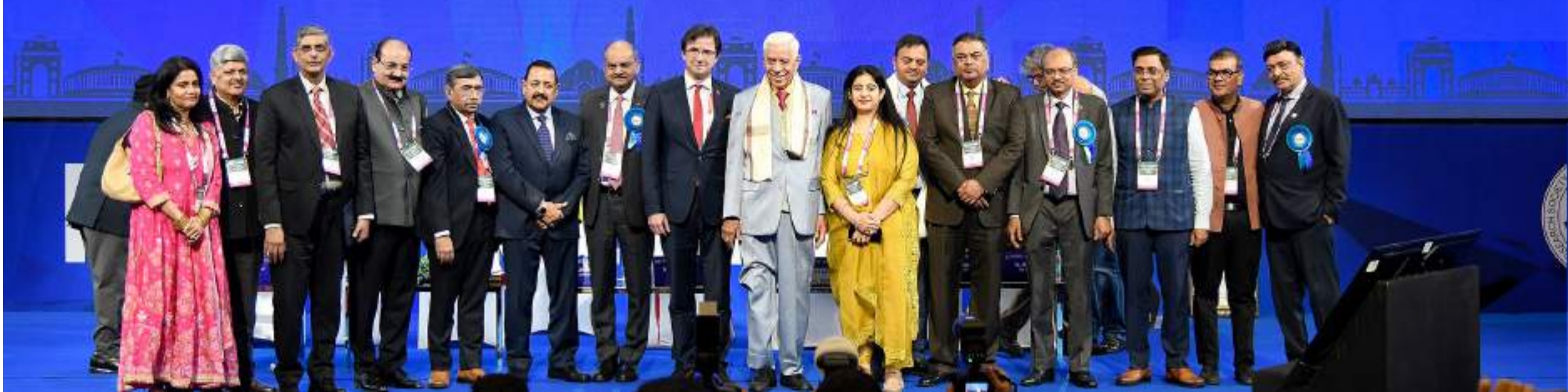
The Minister of State for Science & Technology (Independent Charge), Earth Sciences (Independent Charge), Prime Minister's Office, Personnel, Public Grievances & Pensions, Atomic Energy and Space, Dr. Jitendra Singh in a group photograph during the 52nd Annual Conference of the Research Society for the Study of Diabetes in India at Yashobhoomi, Dwarka, in New Delhi