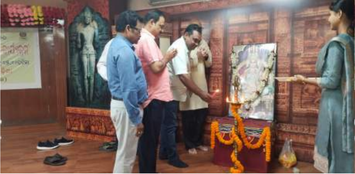
and literary contributors for their dedication to Odisha's development. He further encouraged all officials to participate attentively and consistently strive to elevate the use of Odia