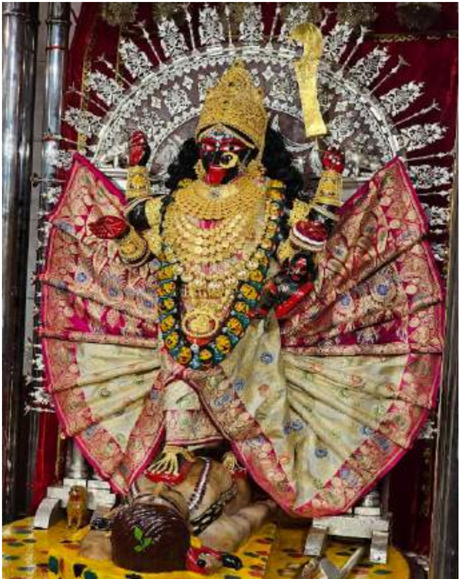
Bhavatarini Maa Kali in Dakshineswar on the day of Kali Puja.

requirements of the proposed integrated steel plant, a company statement said. Meanwhile, the Odisha government has identified two patches of land for the purpose in Keonjhar district. One patch of 2,500 acres of land is located near Odisha Tea Plantation Ltd (OTPL) in the Taramakant area under Banspal block, while the other one of 1,956 acres is at Patna, which was initially offered to steel major ArcelorMittal. This will be considered the second attempt by the South Korean steel major to set up a steel plant in Odisha. It had earlier scrapped its plan for a 12 million tonnes steel mill in Odisha's Paradip and surrendered the land allotted for the project due to protests and certain regulatory issues several years ago.