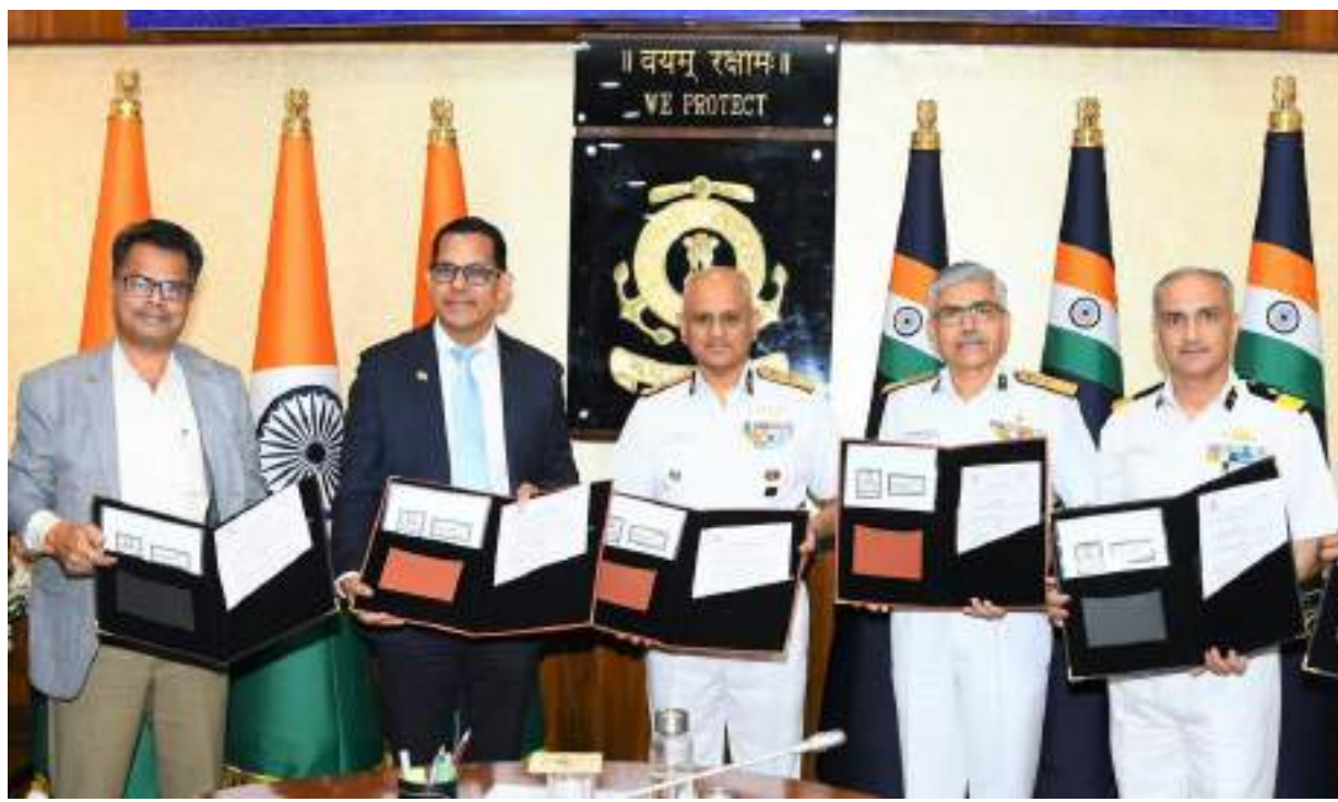
Indian Coast Guard (ICG) and Jindal Steel & Power (JSP) signed a Memorandum of Understanding (MoU) for the supply of indigenous marine grade steel to enhance the indigenous content in shipbuilding, in New Delhi