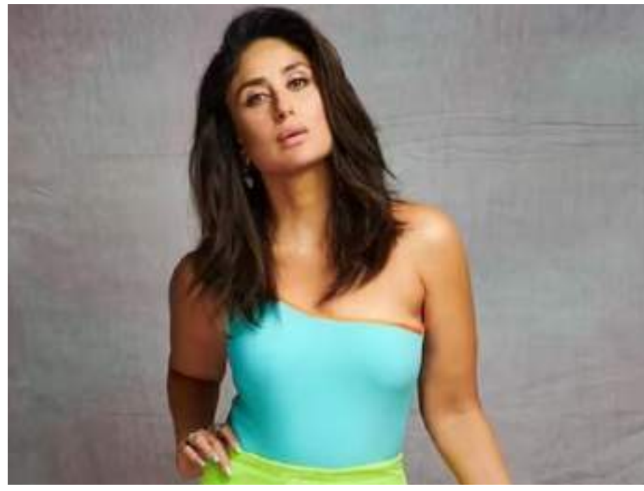
figure in the film industry. His meteoric rise, coupled with endorsements from industry peers like Kareena Kapoor Khan, reinforces his status as a true global icon. Yash has etched his name as a formidable talent with global appeal. He is not just a superstar; he is an icon who has united audiences from diverse backgrounds and cultures, proving that talent and authenticity are universal languages that transcend boundaries and create lasting legacies.

Yash's presence on the international stage has transcended geographical boundaries, making him a sought-after