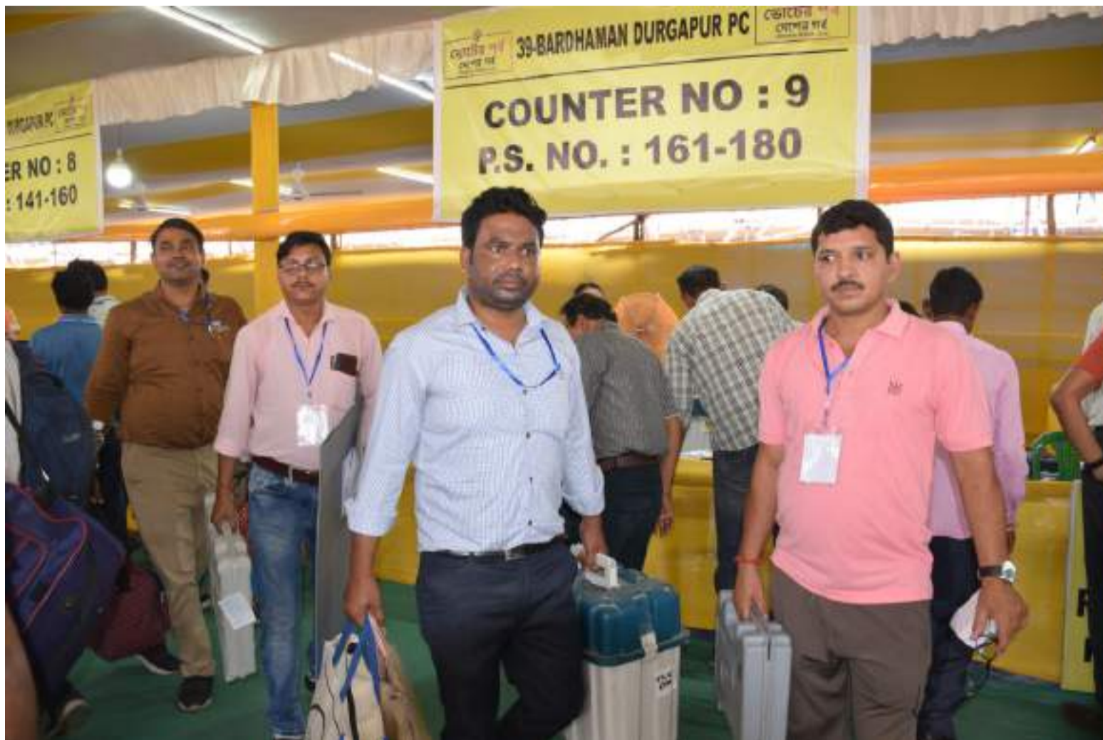
Polling parties carrying EVM's-VVPAT's and other polling materials are rushing to polling stations in Bardhaman-Durgapur Parliamentary, West Bengal