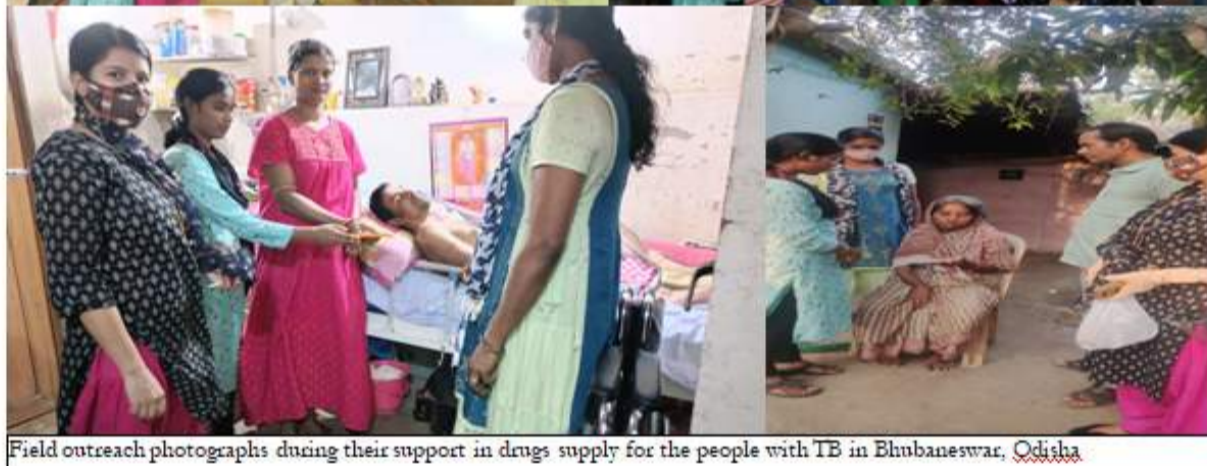
Field outreach photographs during their support in drugs supply for the people with TB in Bhubaneswar, Odisha

simultaneously the involvement of forefront health providers and the community also bit essential to combat these issues. As in the midst of this current drugs crisis situation, those frontline health providers find themselves at the sensitive role for dealing such situations to ensure access to those life-saving TB medication. Over the last few months, the primary TB drugs like 4FDCs and 3FDCs are found to be out of stock, and the facilities in Bhubaneswar also facing great challenges to maintain the drugs management and disbursement. It has been realized that there is major scarcity of drugs across all the facilities starting from state to districts and districts to sub-districts. This situation has been deeply realized by the TB Champions who are working under REACH ALLIES Project and their role is to provide need-assessment through their personal Interview using a standard CAF tool by visiting at their door-step. So, while they were on the visit, they went through these struggle and experience of drugs crisis and how that was affecting people with TB on their treatment and