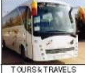
TOURS &amp; TRAVELS

Required Single / Double / Triple Storied North/East facing building at Puri. Contact 9437143483