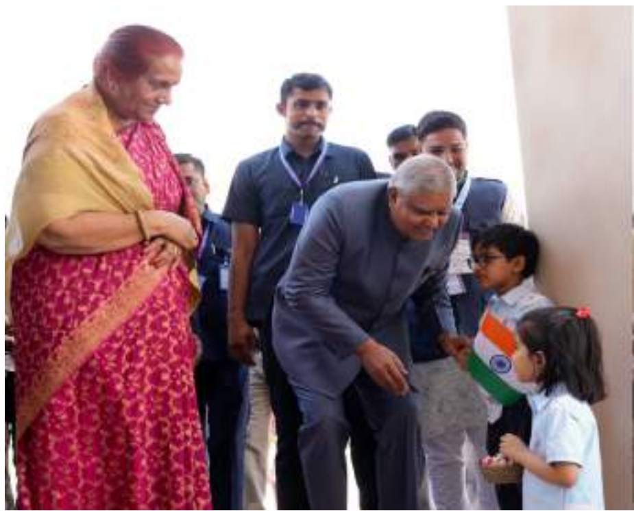
The Vice President, Shri Jagdeep Dhankhar & Dr. Sudesh Dhankhar interacting with students of The Kulish School at Jaipur, in Rajasthan