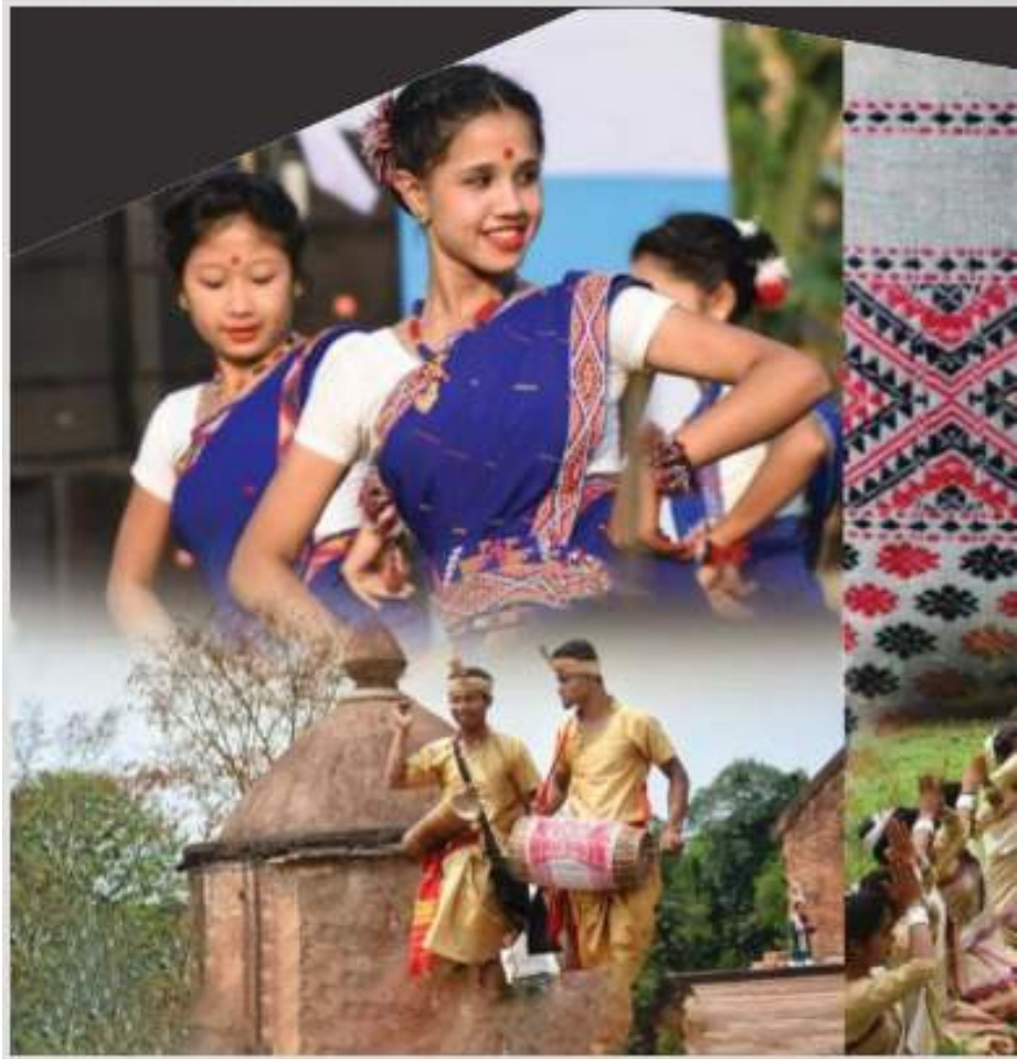
People and Culture

related to agriculture. Bihu has its origin from the Tai word 'Pi-hu' or 'Poi-Hu'. People of Sivasagar observe various traditional festivals and rituals among which Bihu is of great importance. Poi-Chankein or Bohang Bihu (observed in April) is the main festival and is observed at the beginning of Spring Season. It is celebrated right before the paddy cultivation. In this festival, people wish for a good harvest because this is the time when farmers start sowing. Chip-song-ka or Kaati Bihu (observed in October) is celebrated to mark the cutting and binding of grain and Meji Joluwa Utsav or Magh Bihu (observed in January-February) marks the season of harvesting of the crops. The main aspect of these three celebrations is the ancestor worship called Me-Dam-Me-Phi. Where, Me means worship, Dam means the dead and Phi means God. That is, the dead are worshipped as Gods. Another very popular festival celebrated in the new year's month of Dinsing or Aghun is called Kinon-Meu or Na-Khuwa. In these festivals, the first produce of the season is offered to the ancestors. Some of the traditional rituals performed during these festivals are chanting of