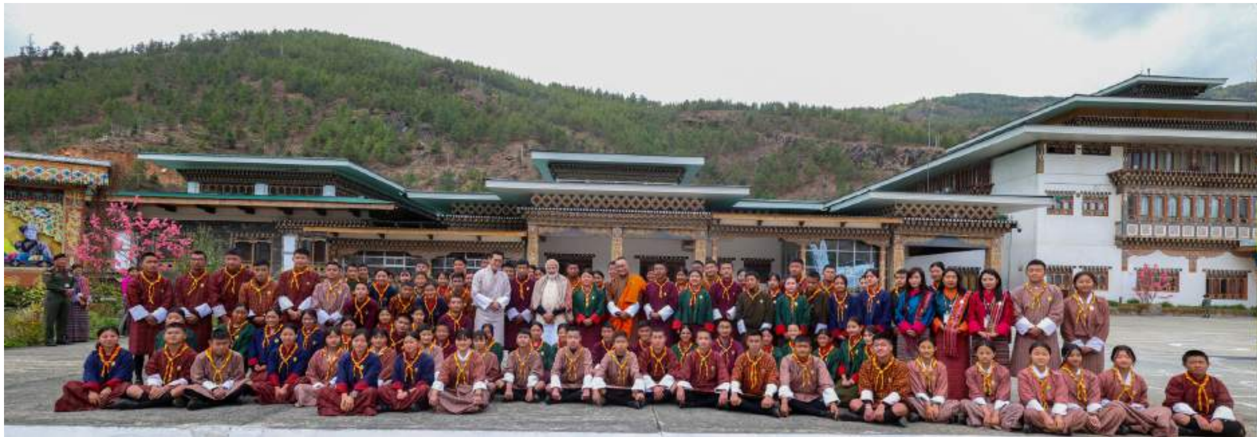
PM with the King of Bhutan, Mr. Jigme Khesar Namgyel Wangchuck at Thimphu, in Bhutan