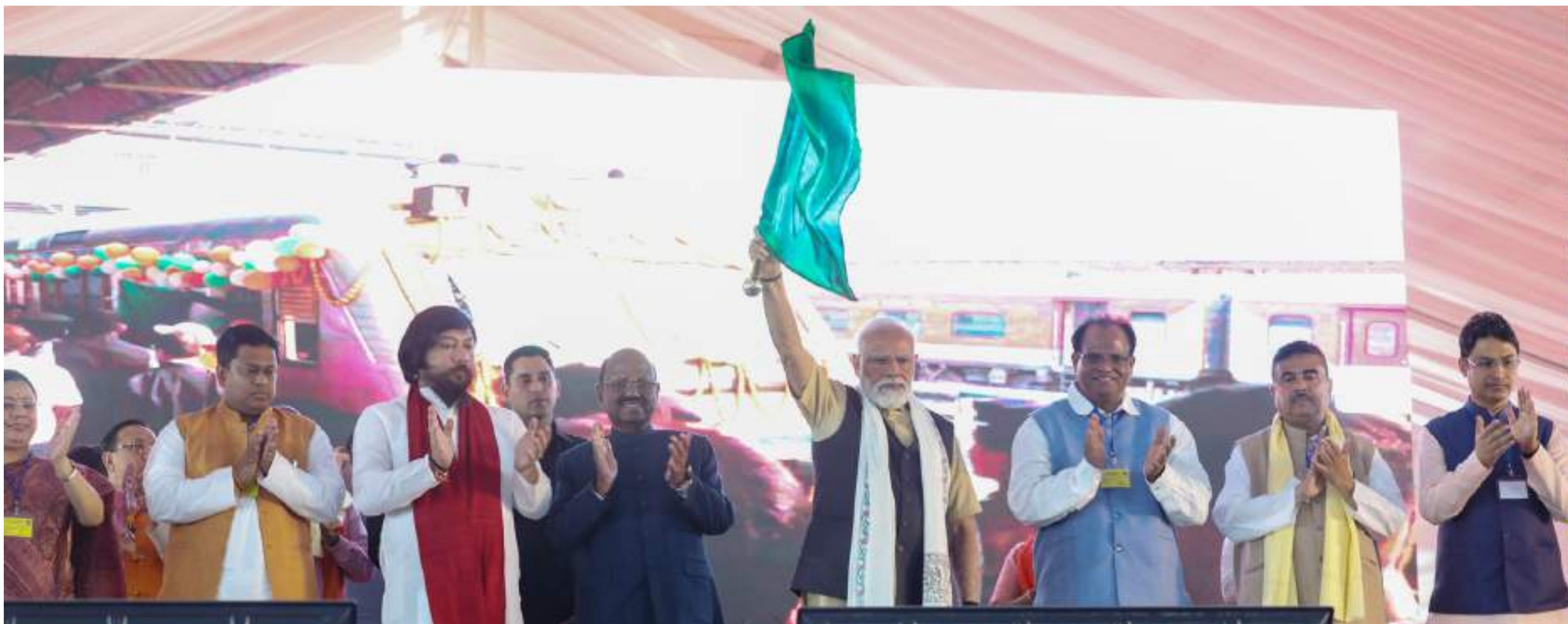
PM flags off new passenger train service between Siliguri and Radhikapur during the "Viksit Bharat Viksit West Bengal program" at Siliguri, in West Bengal