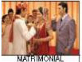
MATRIMONIAL BRIDE WANTED

Saving 10,000/- for high return, extra earn and foreign trip opportunity, 838904001. Independent business work from home, training in Singapore, 8389014287.