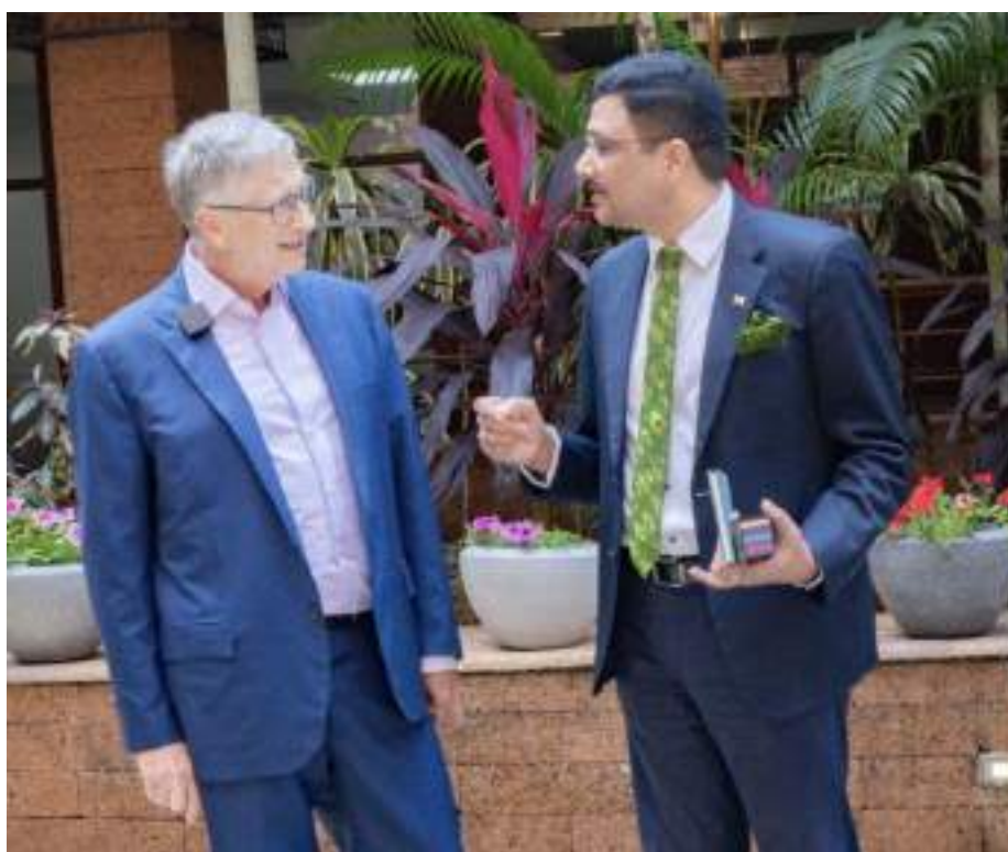
"Pleasure meeting @Microsoft co-founder and philanthropist Mr @BillGates. Had a