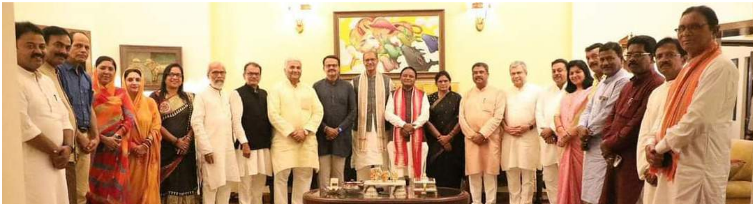
Odisha Chief Minister Mohan Majhi, Deputy chief ministers KV Singh Deo, Smt Pravati Parida, Education Minister Dharmendra Pradhan, Railway and I&B Minister Ashwin Baishnav with newly elected MPs at Odisha Bhawan, New Delhi