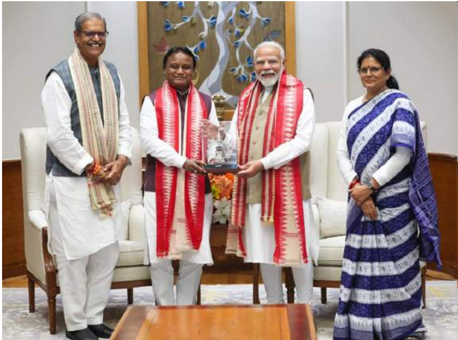
Chief minister Mohan majhi & his two deputies KV singh deo, Smt Pravati parida called on Prime Minister Narendra modi at PMO, New delhi