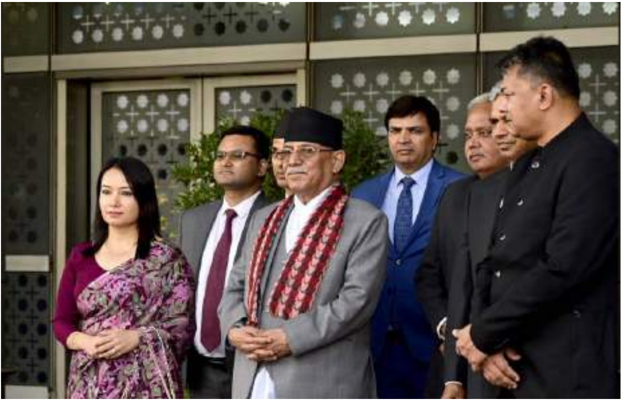
The Prime Minister of Nepal, Shri Pushpa Kamal Dahal arrives for attending the Swearing-in Ceremony of the Prime Minister of India and the Council of Ministers, in New Delhi