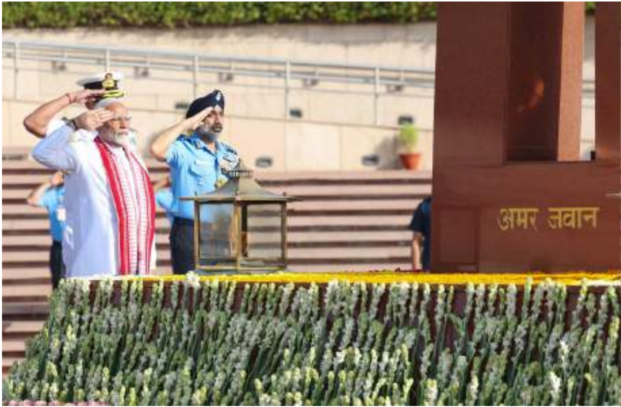
PM paying homage to the martyrs at the National War Memorial, in New Delhi