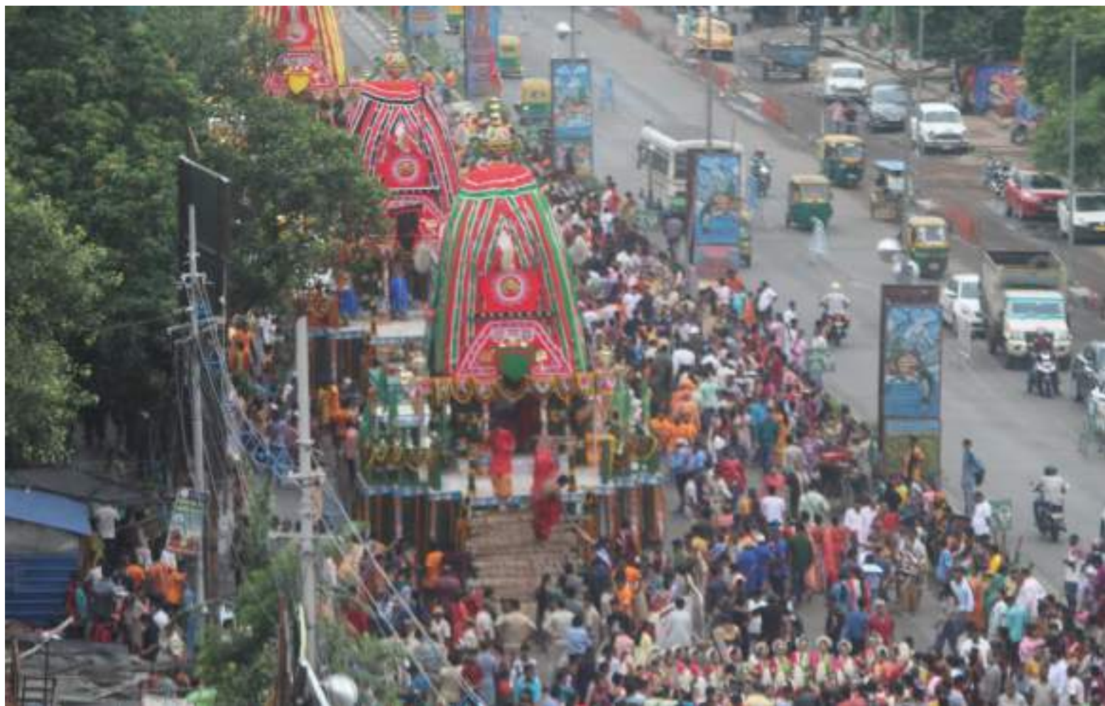
Rath Yatra at BT Road Rathtala , Kolkata.