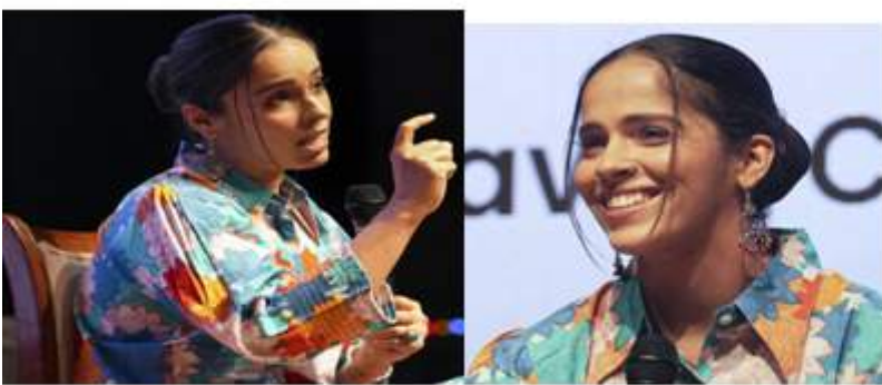
Saina Nehwal addressing a press conference at Rashtrapati Bhavan. "Sometimes I feel that it would have been good if my parents had put me in tennis," Saina remarked. "There is more money, badminton career and encouraged the young audience to consider pursuing a career in sports. and I had more strength, I think. I could have done better in tennis than badminton," she added. While Saina has inspired

many to take up badminton, the 34-year-old herself lacked role models when she started playing at the age of eight. "When I started, I didn't have any role models to look up to. No one to look up to and say, 'I want to be world number one or be an Olympic medalist.' I hadn't seen anyone do that in badminton before me," Saina explained. "I always tell children to concentrate on sports. China wins 60-70 medals, while we only get 3-4. There are so many doctors and engineers, but their names don't appear in newspapers," she said. Reflecting on her career, Saina Nehwal stated that her hard work compensated for any lack of natural talent. "I loved hard work; I was not the most talented person and needed to practice a lot. If a talented player did something 100 times, I had to do it 1000 times. But I liked hard work. My coaches