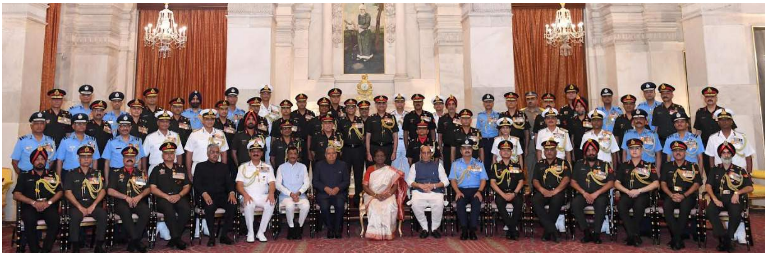
The President of India, Smt Droupadi Murmu presented Distinguished Service Awards at the Defence Investiture Ceremony-2024 (Phase-II) held at Rashtrapati Bhavan today