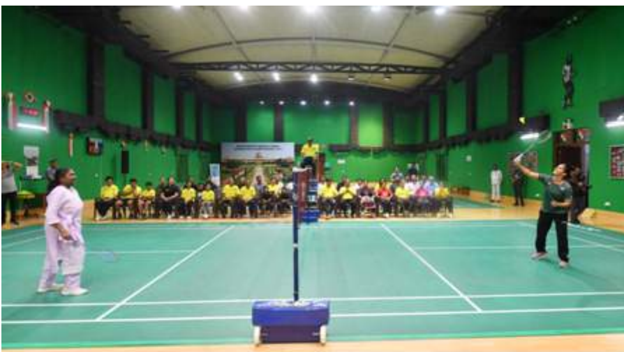
Saina Nehwal playing badminton with President Draupadi Murmu at Rashtrapati Bhawan badminton courts.