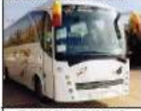
TOURS &amp; TRAVELS

Required Single / Double / Triple Storied North/East facing building at Puri. Contact 9437143493