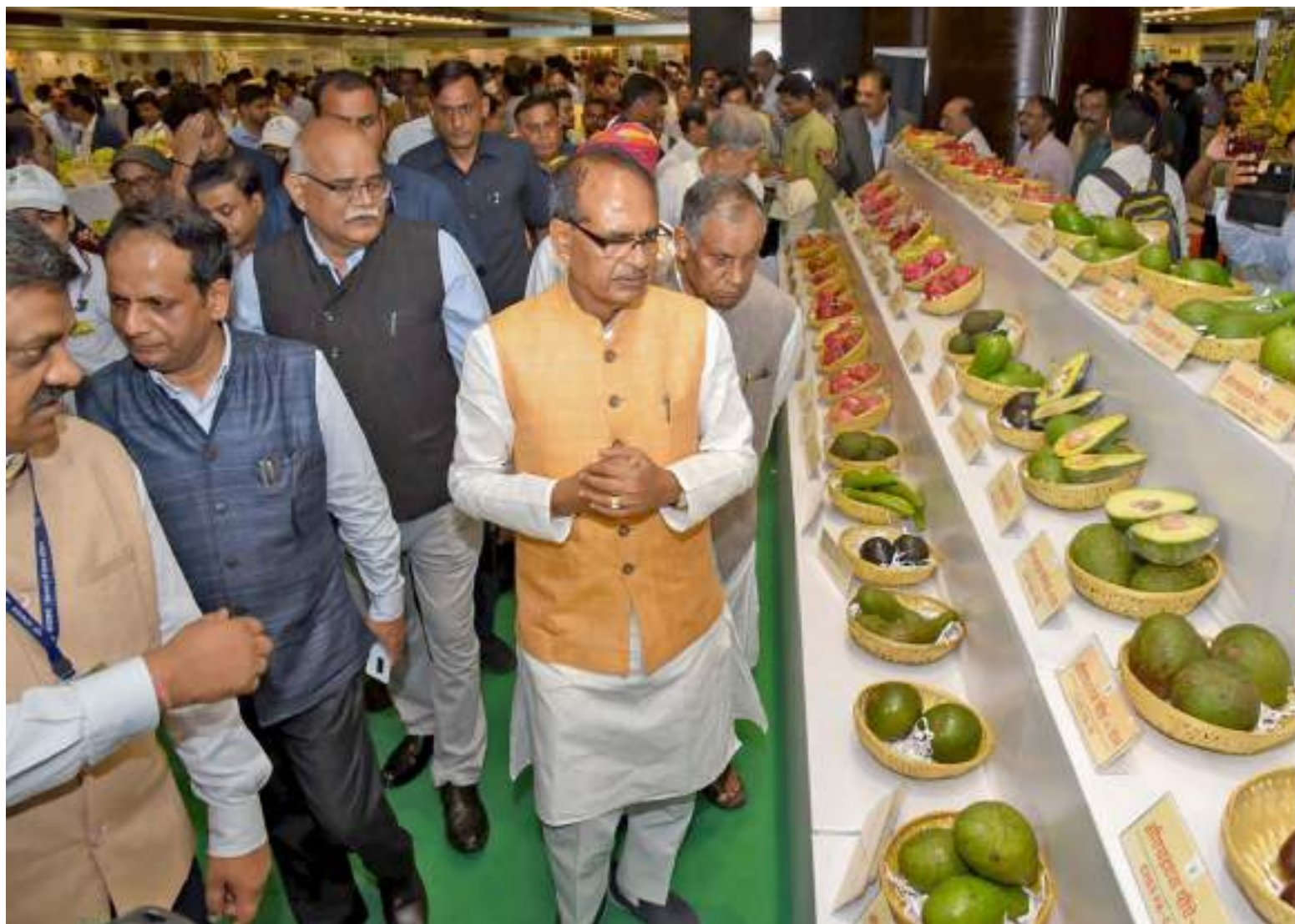
The Union Minister of Agriculture and Farmers Welfare and Rural Development, Shri Shivraj Singh Chouhan visits an exhibition at Bharat Ratna C. Subramanian Convention Center, NASC Complex, in New Delhi