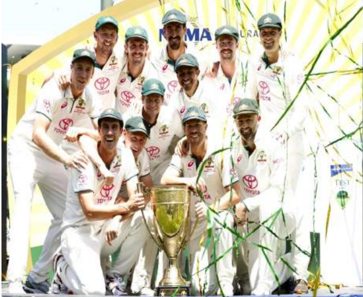
Australia celebrate with the Benaud-Qadir trophy

September, CSA declared losses of USD6.4-million. And that was held up as good news - a bigger deficit had been anticipated. The SA20 turned an unexpected profit in last year's inaugural edition, USD1.9-million of which went to CSA. That's USD300,000 more than Australia earned for beating India in the WTC final at the Oval in June. The truth is cricket in South Africa needs money more than it needs WTC points. Burning 24 of them in New Zealand, should that happen, isn't too high a price to pay for another SA20 windfall. No, that isn't a joke.