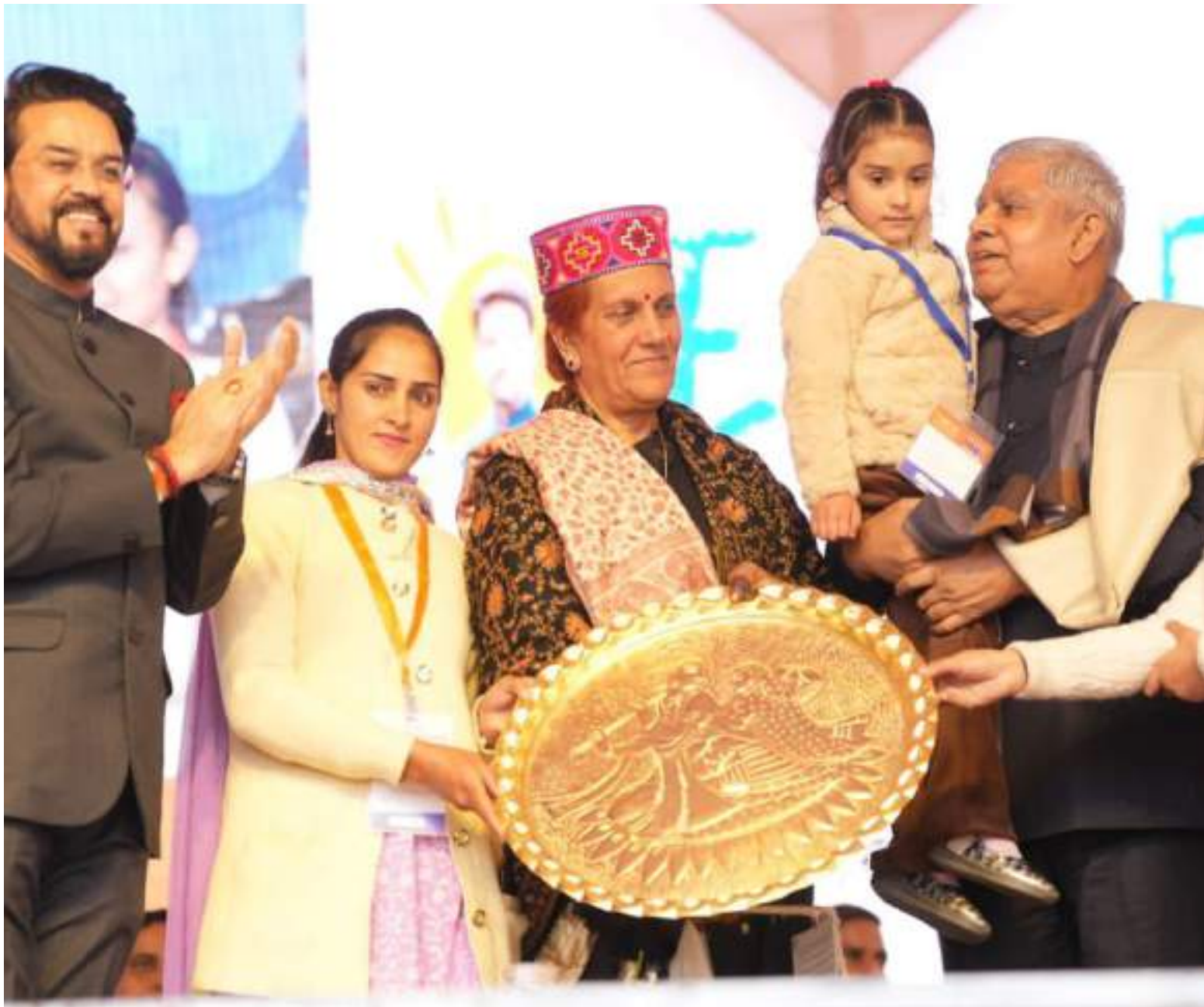
The Vice President and Chairman, Rajya Sabha, Shri Jagdeep Dhankhar graced the inauguration ceremony

investment in Tamil Nadu's history. Government of Tamil Nadu will be providing cleared land for the manufacturing facilities, uninterrupted power supply, and other infrastructure support on a best-effort basis. VinFast plans to have a nationwide dealership network to establish a strong brand presence and swiftly connect with customers across India. VinFast is in discussion with TN Government and planning to set up EV charging station across the state. The project is part of Comprehensive Strategic Partnership and will be strengthening relationship between Vietnam and India.