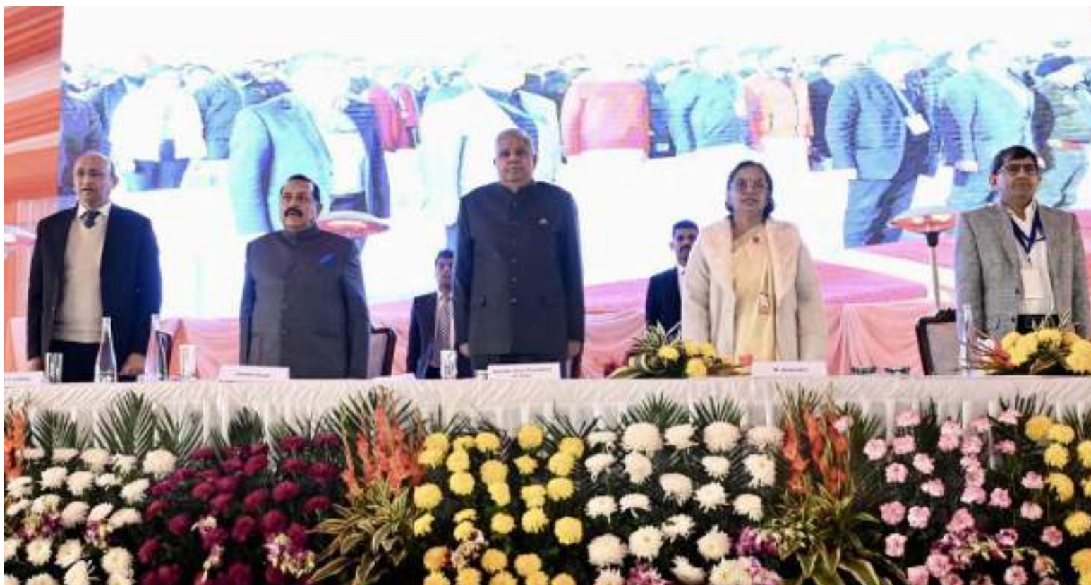
The Vice President and Chairman, Rajya Sabha, Shri Jagdeep Dhankhar at the Biotech Startup Expo on "Emerging Startup Trends in North India" at Kathua, in Jammu & Kashmir