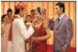
MATRIMONIAL BRIDE WANTED

Saving 10,000/- for high status, extra earn and foreign trip opportunity, 1238904001. Independent business work from home, training in Singapore, 1338014287.