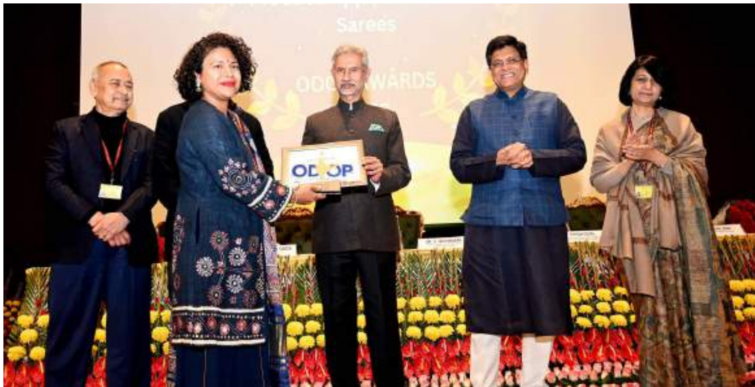
The Union Minister for External Affairs, Dr. S Jaishankar felicitates 'One District One Product' winners during Aatmanirbhar Bharat Utsav celebration in presence of the Union Minister for Commerce & Industry, Consumer Affairs, Food & Public Distribution and Textiles, Shri Piyush Goyal at Bharat Mandapam, in New Delhi