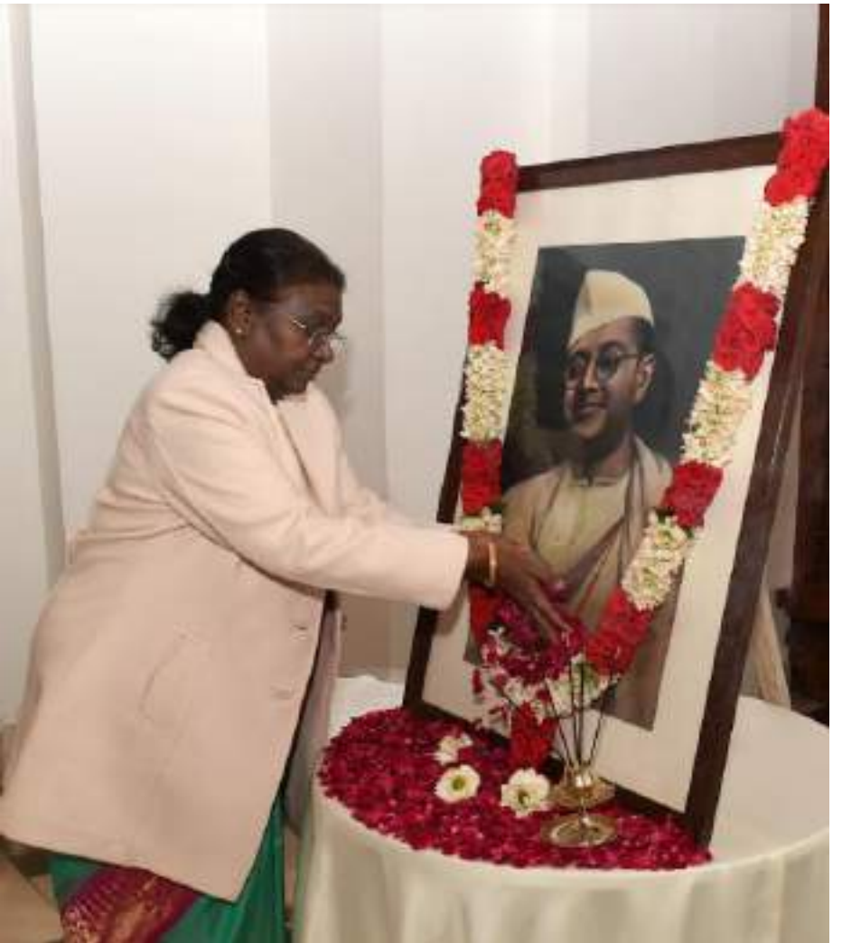
New Delhi, (KCN): The President of India, Smt Droupadi Murmu paid homage to Netaji Subhas Chandra Bose on his birth anniversary today (January 23, 2024) which is being celebrated as Parakram Diwas. She paid floral tributes in front of a portrait of Netaji at Rashtrapati Bhavan.

Mr Kumar had broken away from the NDA ahead of the 2014 general elections but returned to the fold in 2017. Less than two years ago, he walked out again, forming government with a new alliance that has all parties of Bihar -- small and big -- on board. That move had left then BJP out in the cold, with a fractured Lok Janshakti party for company. The BJP's isolation factor has cemented the spin on today's events, leaders indicate. The Bihar BJP leaders though, have been caught unawares. Leaders confided that the party high command never gave them any hint about this. Else they would have "vociferously made this demand", which was continuously raised by Mr Kumar's Janata Dal United and Tejashwi Yadav's Rashtriya Janata Dal.