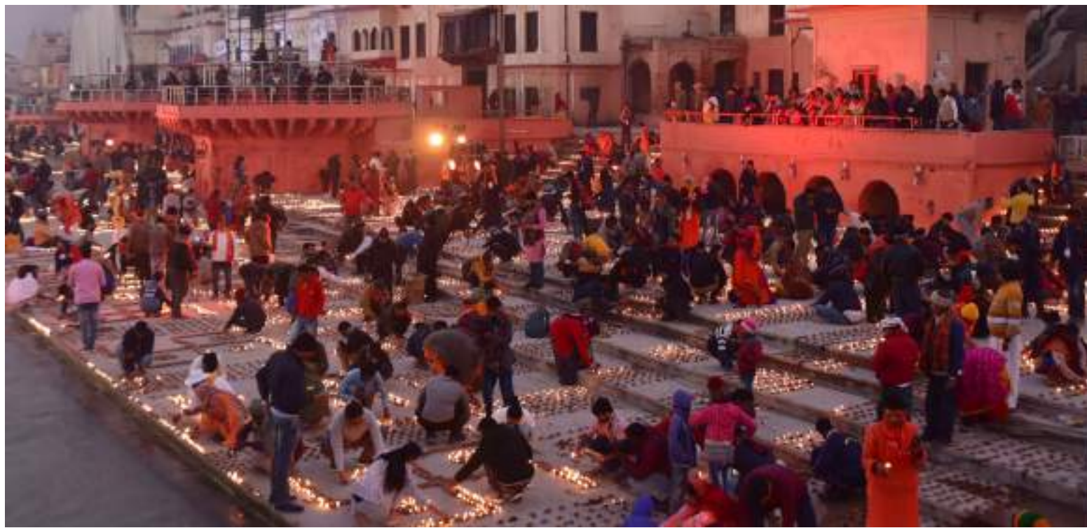
Sarayu ghat illuminated with diyas after the Pran Pratishtha ceremony of Shree Ram Janmaboomi Temple in Ayodhya, Uttar Pradesh

Assam Chief Minister and the Union Home Minister are doing and the yatra has become the main issue in Assam, Mr Gandhi said. He also claimed that he was "not allowed" to interact with students of a private university in Meghalaya at the "instructions" of the Union Home Minister Amit Shah. Bharat Jodo Nyay Yatra started on January 14 from Thoubal in Manipur and will end on March 20 in Mumbai. Spanning the country from east to west, it would cover 6200 km, passing through 14 states and 85 districts.