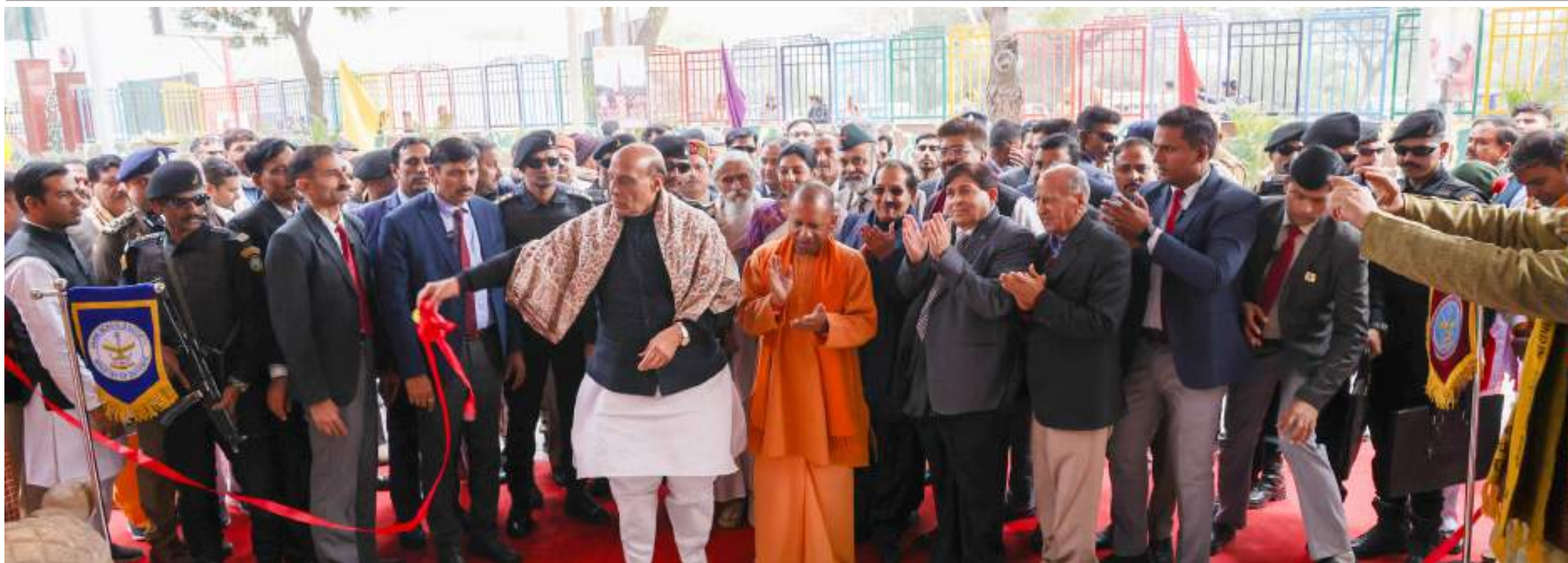
The Union Minister for Defence, Shri Rajnath Singh inaugurates Samvid Gurukulam Girls Sainik School at Vrindavan in Mathura, Uttar Pradesh