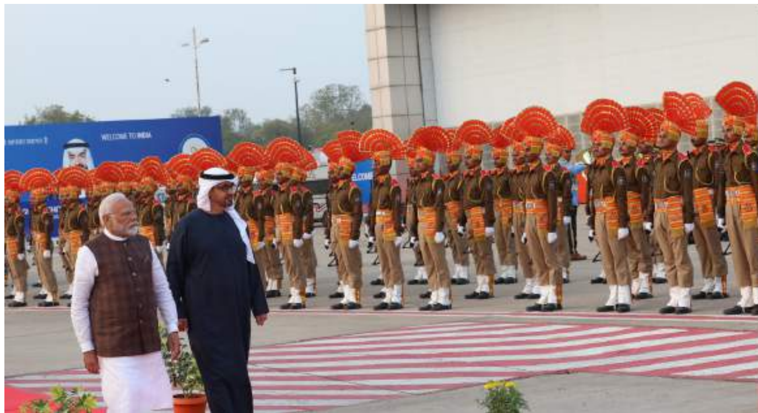
PM welcomes President of the United Arab Emirates, H.E Mohammed bin Zayed Al Nahyan at Ahmedabad, in Gujarat

which would virtually ruin his sanity, peace of mind, career and probably his entire life. Such a threat of attempting suicide amounts to cruelty," the court added. It further said although the wife has a legal right to take recourse for any wrong, making unsubstantiated allegations of having been subjected to dowry demands or acts of cruelty by the husband or his family members and getting criminal trials initiated against them are also "clearly acts of cruelty". "We note that during the two years of their matrimonial life, the parties barely resided together for 10 months in all and even during that time, there were various acts of cruelty of being subjected to false complaints and civil as well as criminal litigation committed by the appellant (wife) towards the respondent," the court said. "We, therefore, conclude that the learned additional principal judge of the family court has rightly held that the respondent was subjected to cruelty by the appellant and granted a divorce under section 13(1)(ia) of the HMA (Hindu Marriage Act). We find no merit in the appeal, which along with the pending applications, if any, is hereby dismissed," the court ordered.