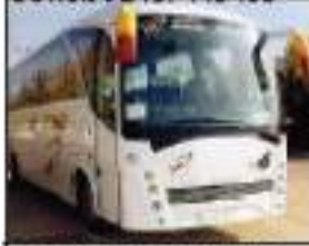
TOURS & TRAVELS

Required Single / Double / Triple Storied North/East facing building at Puri. Contact: 9437142482