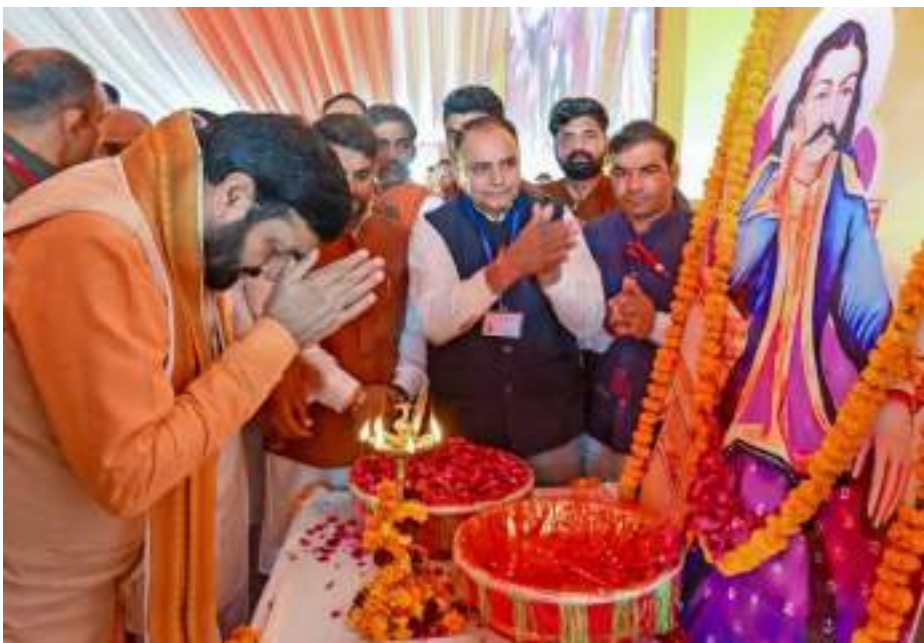
An official release states that the Haryana Government on Sunday celebrated Maharaja Shoor Saini Jayanti with

Over the past 10 years, under the leadership of Prime Minister, Narendra Modi, the BJP government has eradicated these practices and focused on the welfare of all sections of society and the equitable development of all regions, he said. The public has trusted our government's policies, and as a result, for the first time in Haryana's history, a party has formed the government for the third consecutive time, said Nayab Singh Saini while addressing the state-level programme organized on the occasion of Maharaja Shoor Saini Jayanti in Kaithal on Sunday.