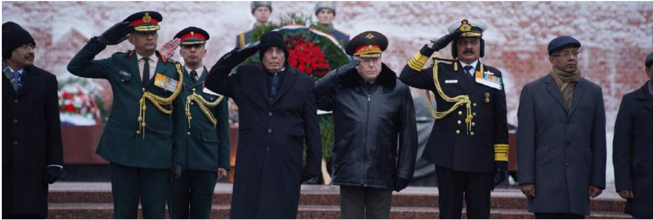
The Union Minister for Defence, Shri Rajnath Singh laying a wreath and paying homage to the fallen heroes at the Tomb of the Unknown Soldier in Moscow, Russia