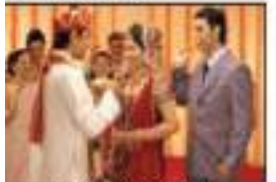
MATRIMONIAL BRIDE WANTED

Independent business work from home, train- ing in Singapore, 8339014287.