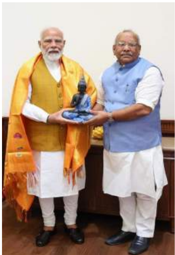
Former Deputy CM of Bihar and current MLA from