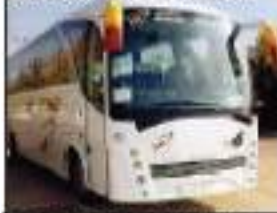
TOURS &amp; TRAVELS

Required Single / Double / Triple Stored North/East facing building at Puri . Contact 9437143493