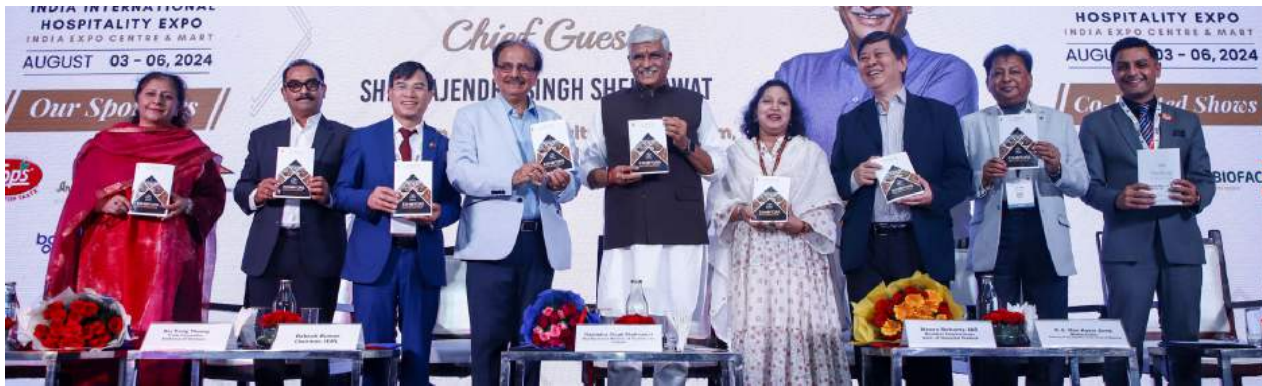
The Union Minister of Culture and Tourism, Shri Gajendra Singh Shekhawat at the inauguration of the 7th Edition of the International Hospitality Expo. 2024 at Greater Noida, in Uttar Pradesh