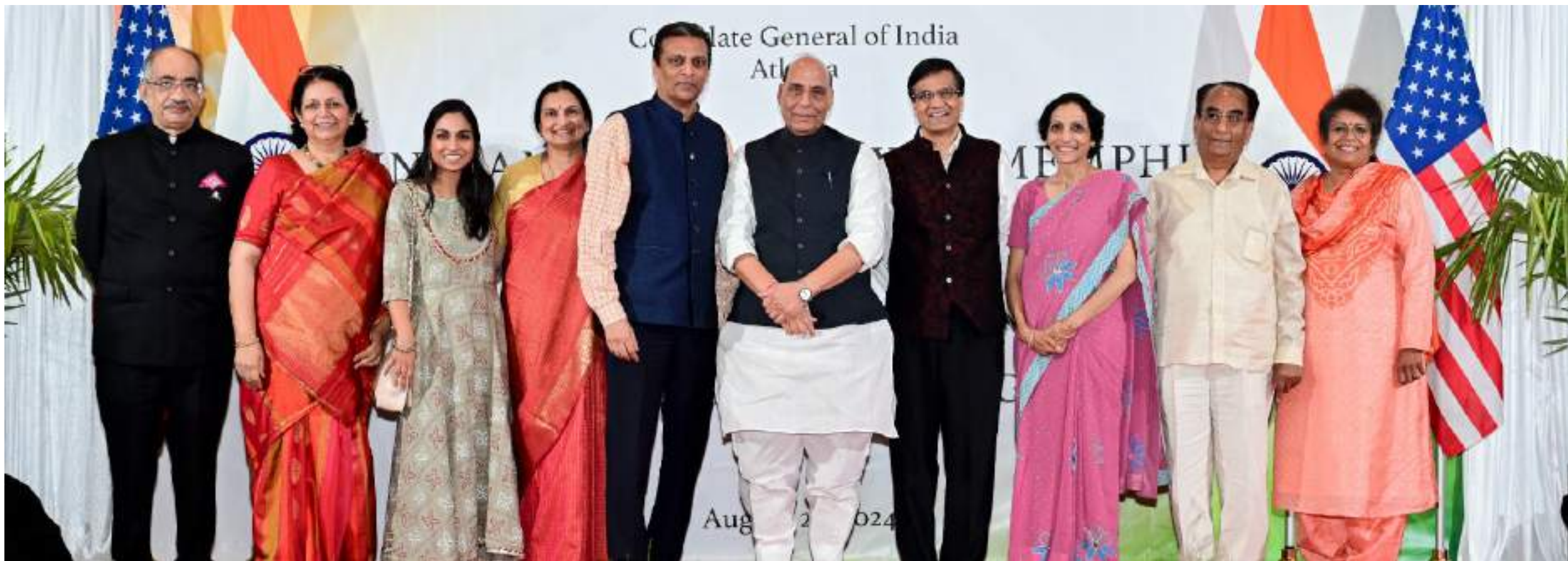
The Union Minister for Defence, Shri Rajnath Singh in a group photograph with Indian community in Memphis, Tennessee, US